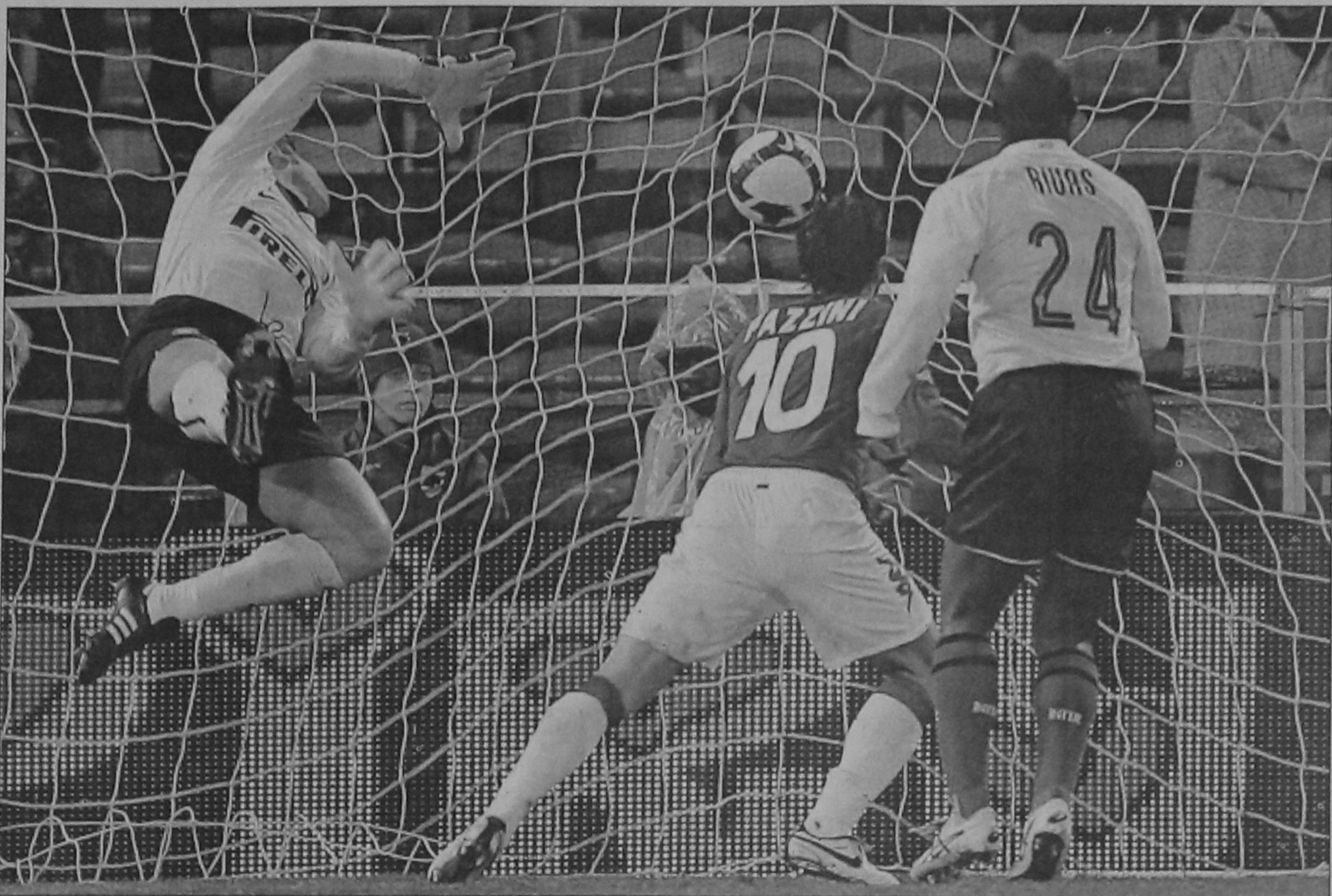
Sampdoria starlet Giampaolo Pazzini (C) scores to make it 3-0 against Inter Milan during their Italian Cup clash at Luigi Ferraris Stadium in Genoa on Wednesday.

Lazio came from behind on Tuesday to beat Juventus 2-1 in their Italian Cup semifinal, first leg after second-half goals from Macedonian forward Goran Pandev and Tommaso Rocchi cancelled out Marco Marchionni's opener on 34 minutes.