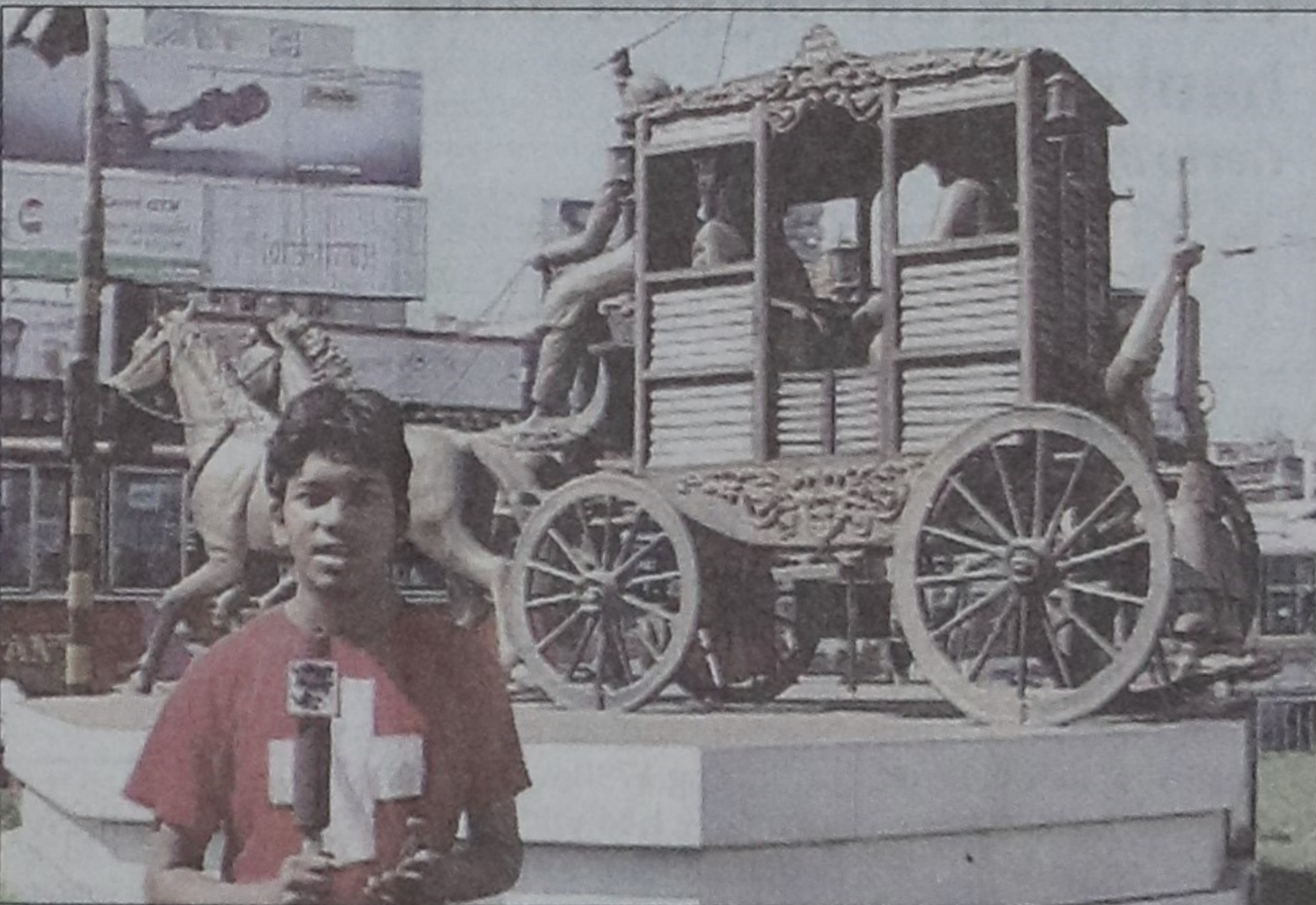
The programme promotes children's journalism in electronic media of the country.