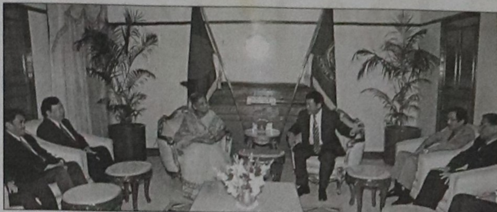
Envoys of the Asean countries call on Prime Minister Sheikh Hasina at her office in the city yesterday. (Story on Page 1)

Bangladesh Medical Association, Mukti Joddha Sanghati Parishad, Moulvibazar Babosayee Samity and Bangladesh Mukti Joddha Sangsad Kendriya Command Council also condemned the killings in separate statements.