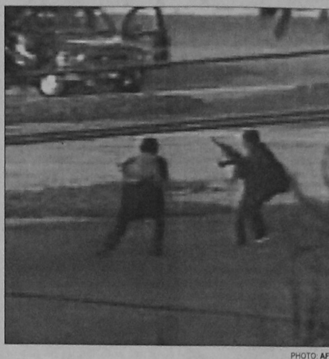
In this frame taken from television unidentified gunmen fire their weapons during an attack on a vehicle carrying the Sri Lankan cricket team in Lahore yesterday.