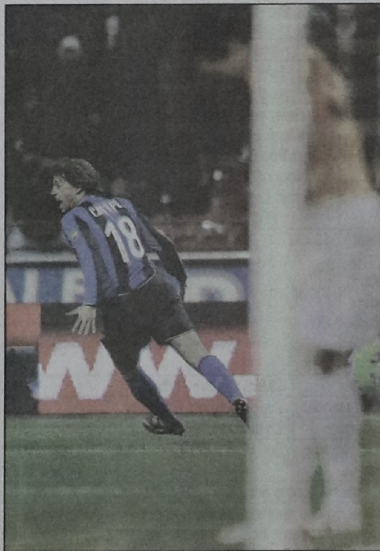
Inter Milan's veteran striker Hernan Crespo runs off to celebrate scoring against Roma during their Serie A tie at San Siro on Sunday.

A fourth goal from Stephane Sessegnon after the interval put a share of the points firmly beyond Nancy's reach.