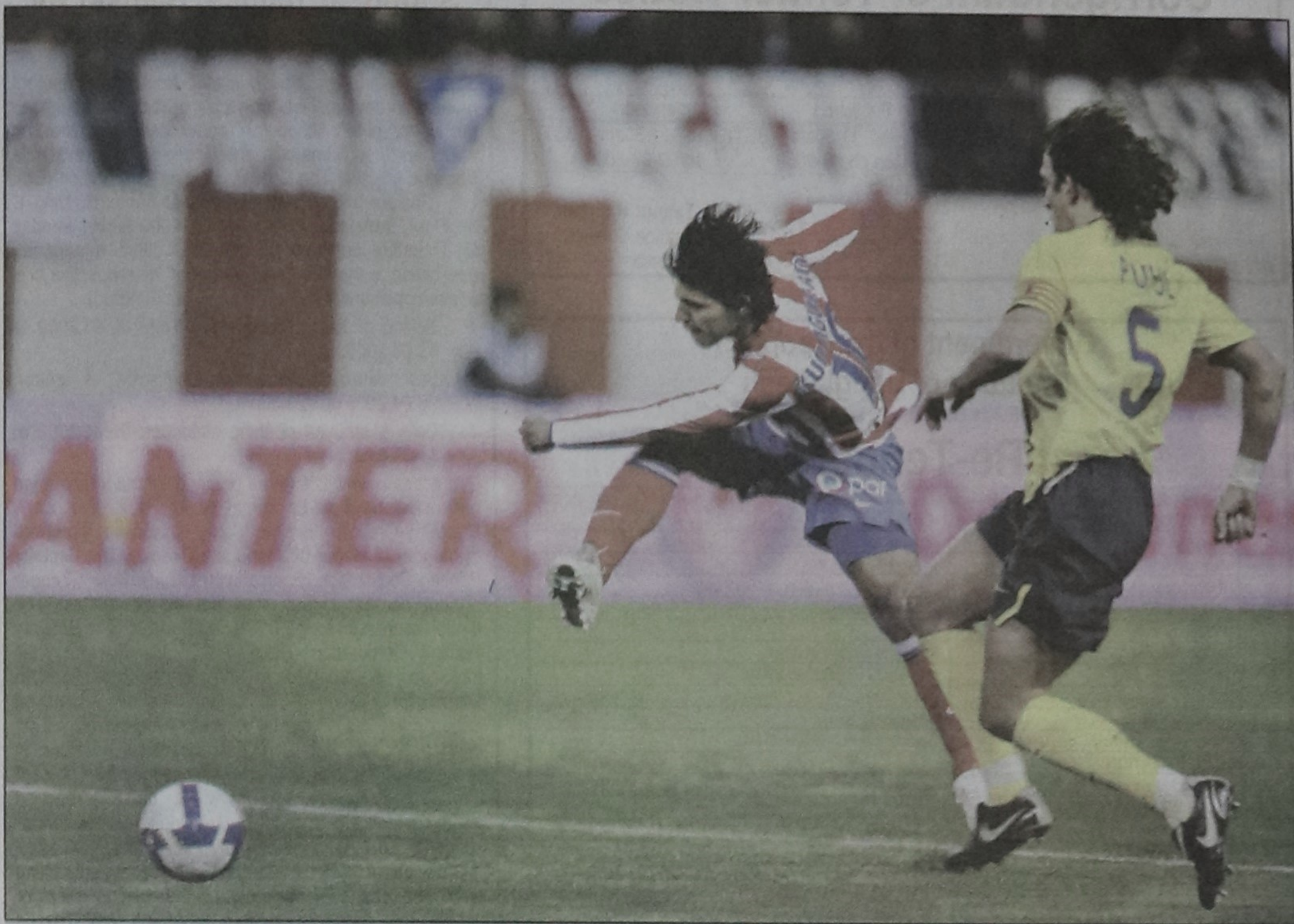
MATCH WINNER: Atletico Madrid starlet Kun Aguero (L) shoots to score the first of his two goals against Barcelona during their Primera Liga encounter at the Vicente Calderon Stadium in Madrid on Sunday.

A Walter Pandiani goal in first-half injury time rescued a point for Osasuna who drew 1-1 with Racing Santander but they are still encamped in the bottom three.