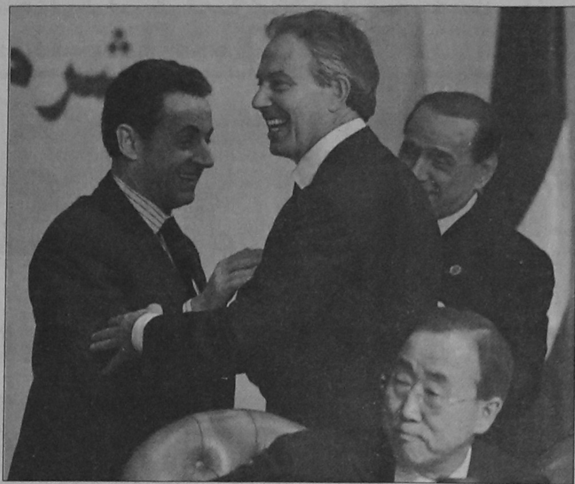
French President Nicolas Sarkozy (L) greets Middle East Quartet envoy Tony Blair (C) as UN Secretary General Ban Ki-moon is seen seated prior to the opening session of the international donors conference for rebuilding the Gaza Strip, in the Egyptian Red Sea resort town of Sharm el-Sheikh yesterday.

Speaking in Gaza City, he said Hamas would not accept any "politicised" reconstruction aid -- a reference to demands by the West that the Islamists renounce violence and recognise Israel and past peace deals in return for diplomatic engagement.