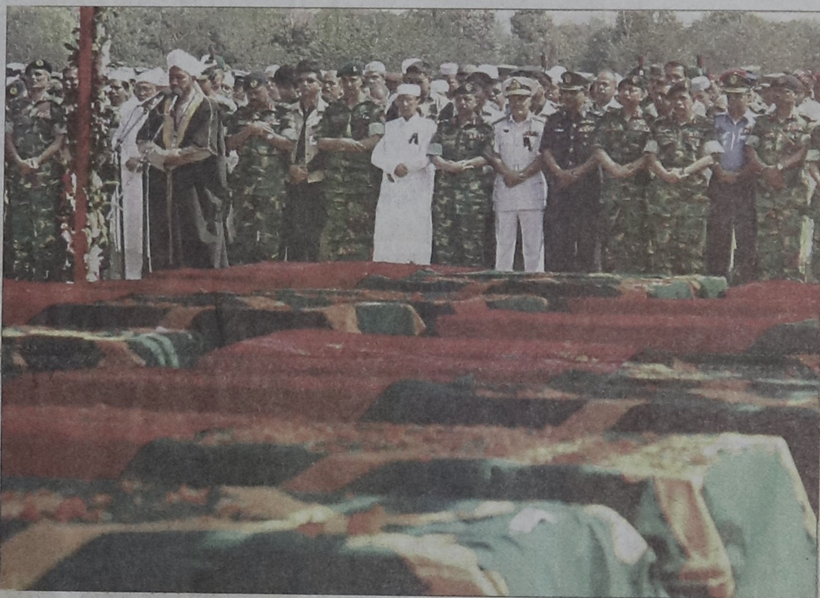
The namaz-e-janaza of 50 victims of the BDR headquarters massacre being held at the National Parade Square yesterday.