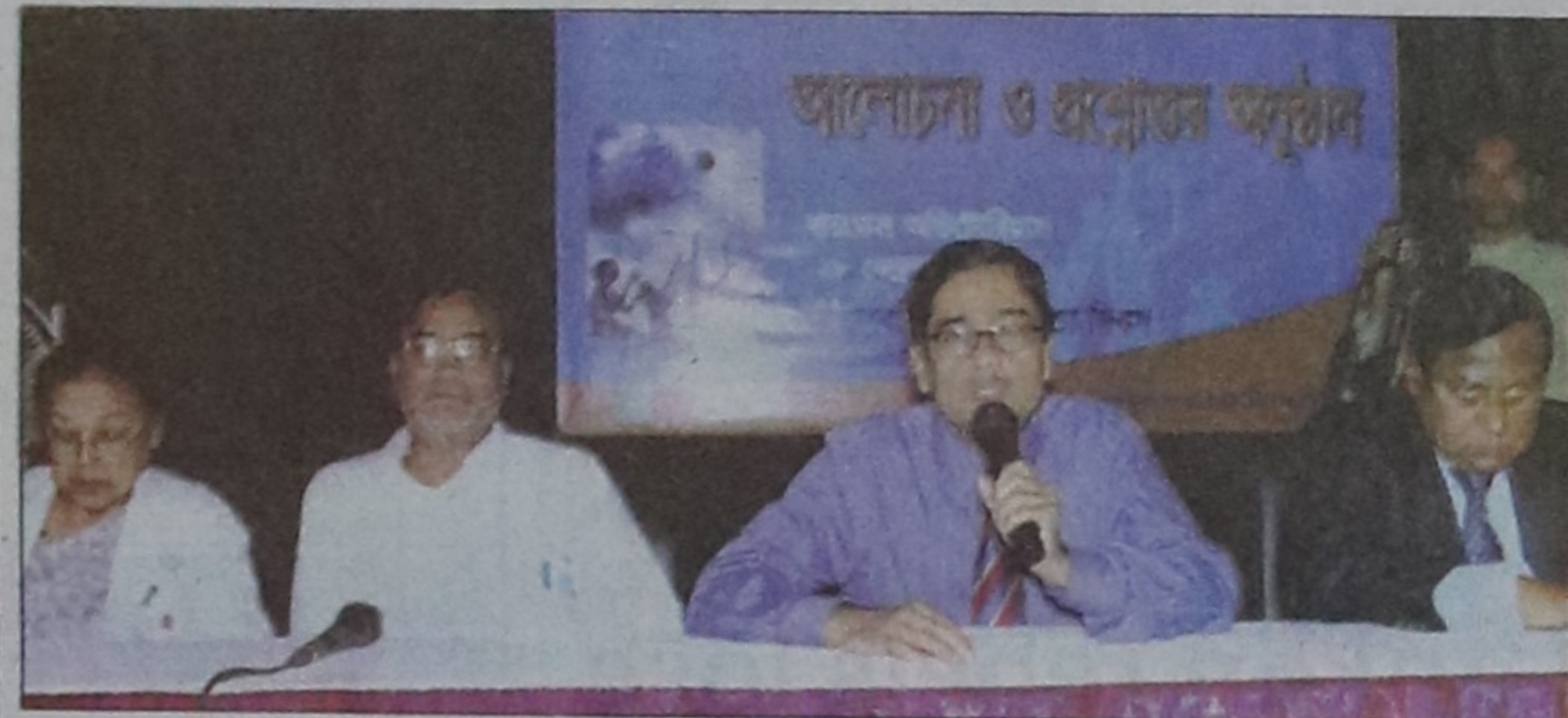
Speakers at a discussion at the Birdem auditorium in the city yesterday. Diabetic Association of Bangladesh organised the discussion to mark the Diabetes Awareness Day and its 53rd founding day.

Affiliated associations at different districts also organised several programmes to mark the day.