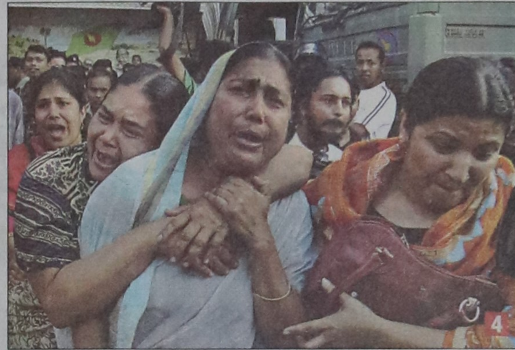
1) A rescue worker points to a bullet hole in the glass of the main gate of Darbar Hall at BDR headquarters yesterday. The gunfire by mutineers broke out at the Darbar Hall on Wednesday morning. 2) Two divers search for arms and ammunition in a pond inside BDR headquarters. 3) A relative of a missing army officer looks at bodies (not in the picture) to identify whether the officer is among the dead. 4) Relatives of an army officer wait in front of BDR Gate No. 4 after they came to know that the officer was killed in the mutiny. 5) Army men recover a number of arms and ammunition used by BDR mutineers. 6) CID personnel collect evidence at Darbar Hall.