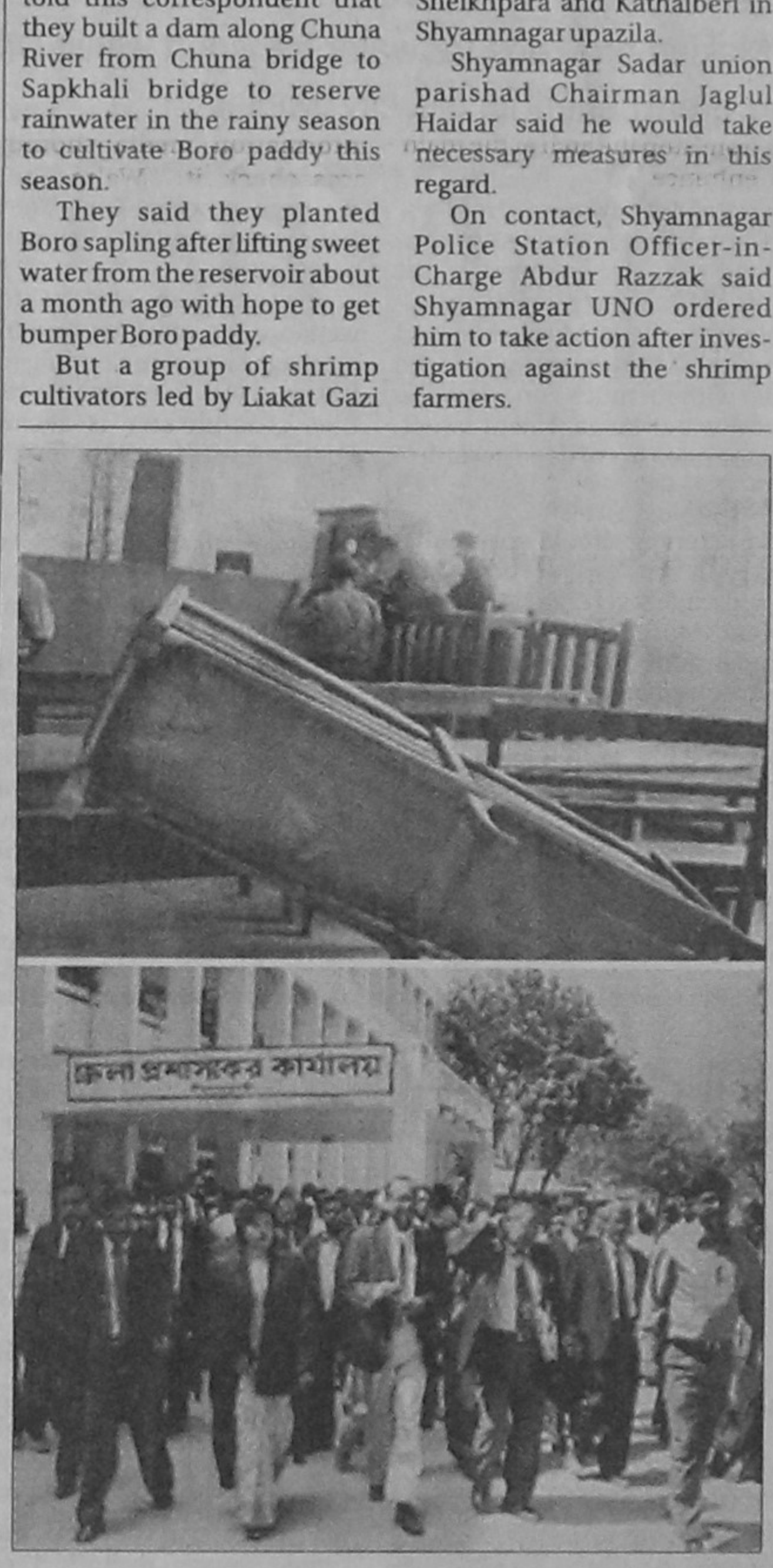
Ransacked room of a magistrate, top, lawyers demonstrate on the premises of Nilphamari Deputy Commissioner's Office on Thursday.