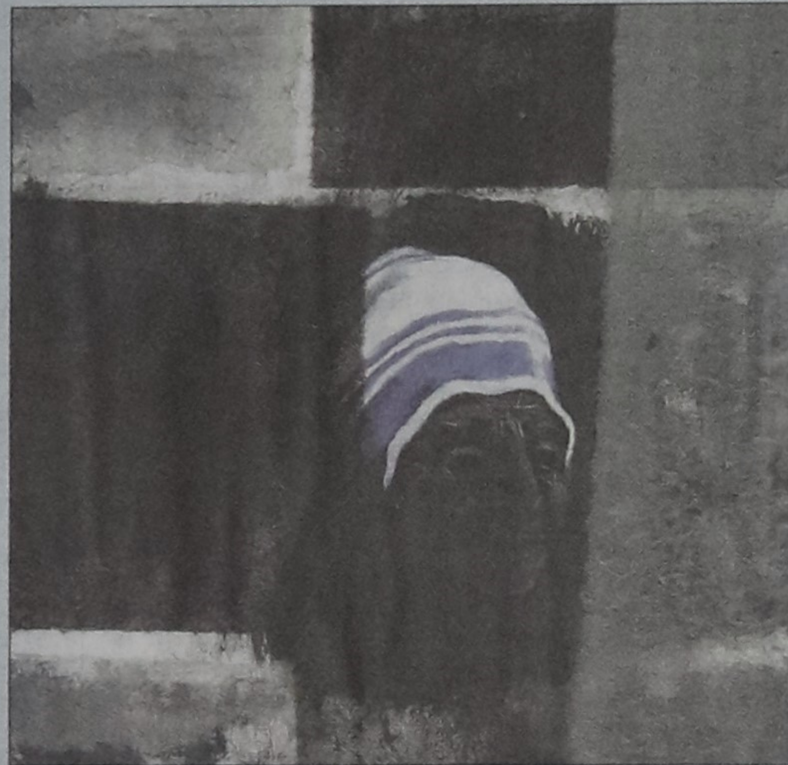
The exhibition included portraits of iconic South Asian personalities by Maksudul Ahsan.