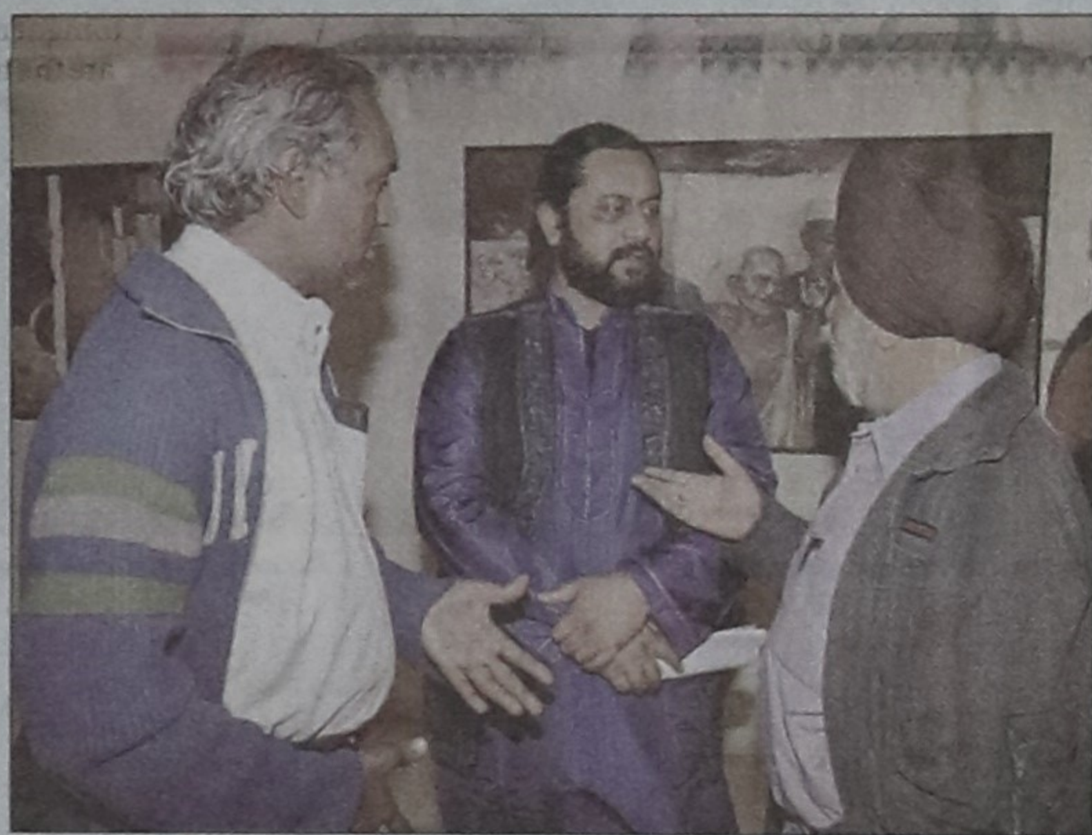
The artist (centre) at the exhibit.

Maksudul Ahsan is one of the notable Bangladeshi painters of the '80s who likes to make portraits of renowned man and women representing different eras in the sub-continent. These individuals have left legacies. They have reformed and reshaped the South Asian society. They are no