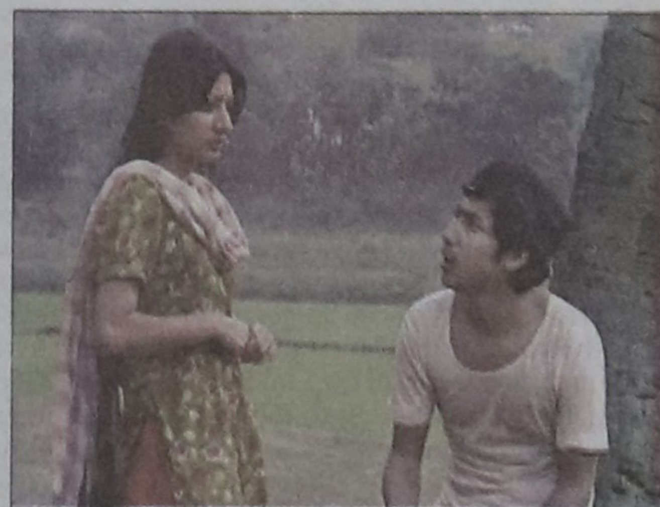
The plot of the serial is set in a village that is home to Muslims, Hindus and Christians who live in harmony.

The plot is set in a village called Sarisuri. Interestingly enough, the residents are all thieves. The village is home to Muslims, Hindus and Christians who live in harmony, respecting and celebrating each other's creed and festivals. The village is virtually isolated from neighbouring areas for its natives' reputation of being swindlers. The local administration is well aware of the villagers' "profession" but does not take severe legal