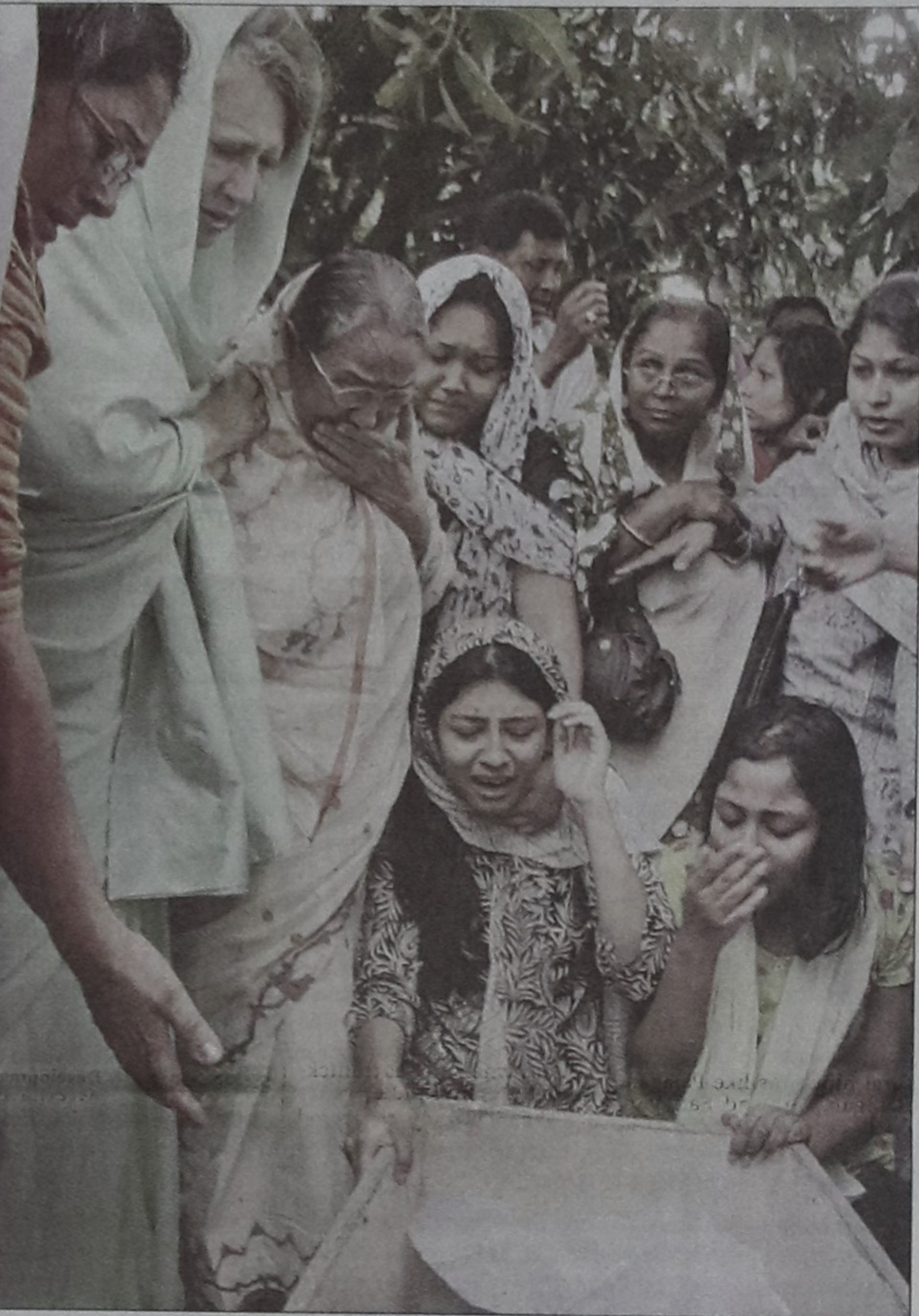
Leader of the Opposition in Parliament and BNP Chairperson Khaleda Zia pays her last respect to an army officer killed in the BDR mutiny at the Combined Military Hospital in the city yesterday. (Story on Page 1)