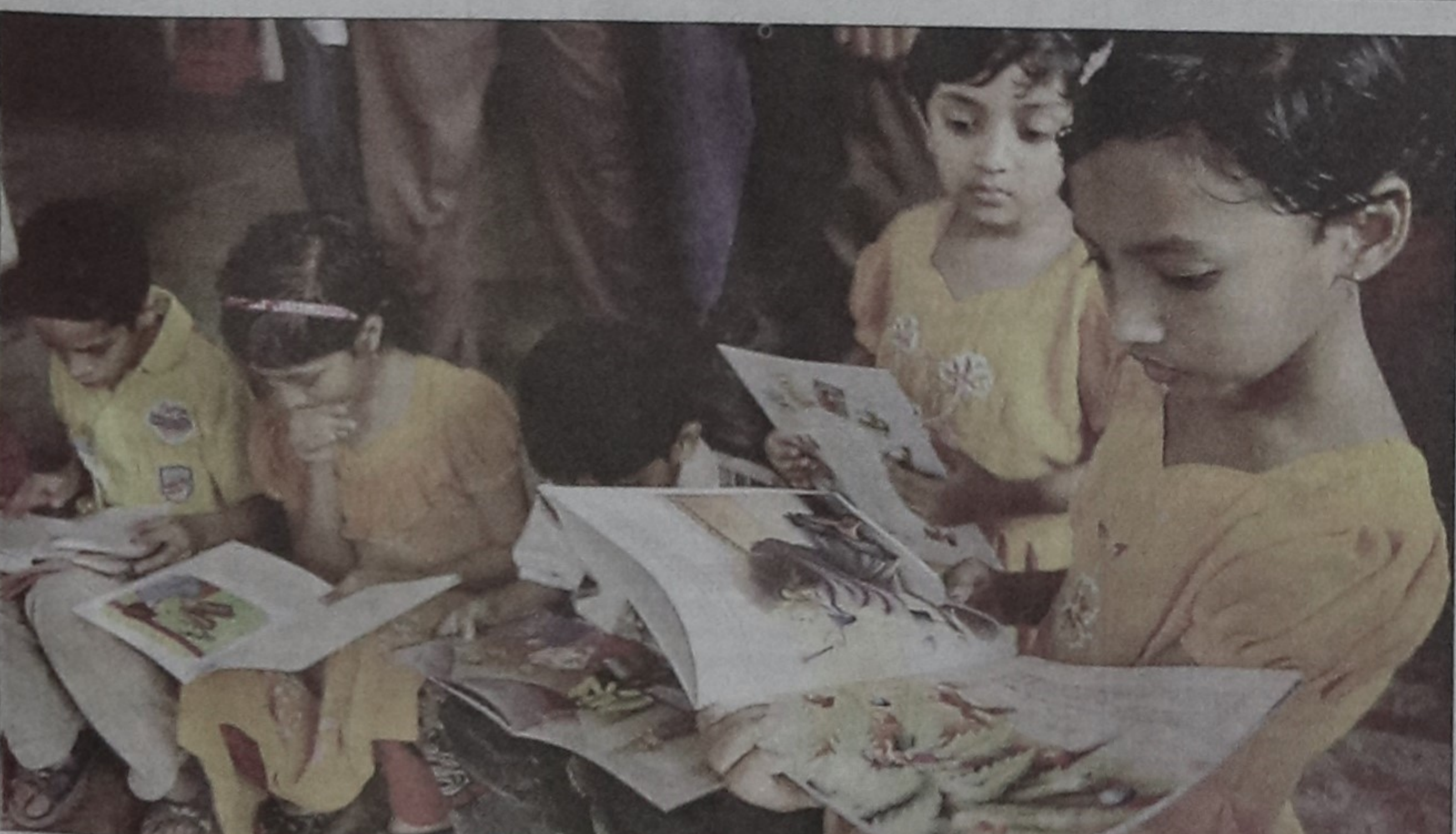
Children flip through books at the Amar Ekushey Book Fair on the Bangla Academy premises in the city yesterday.