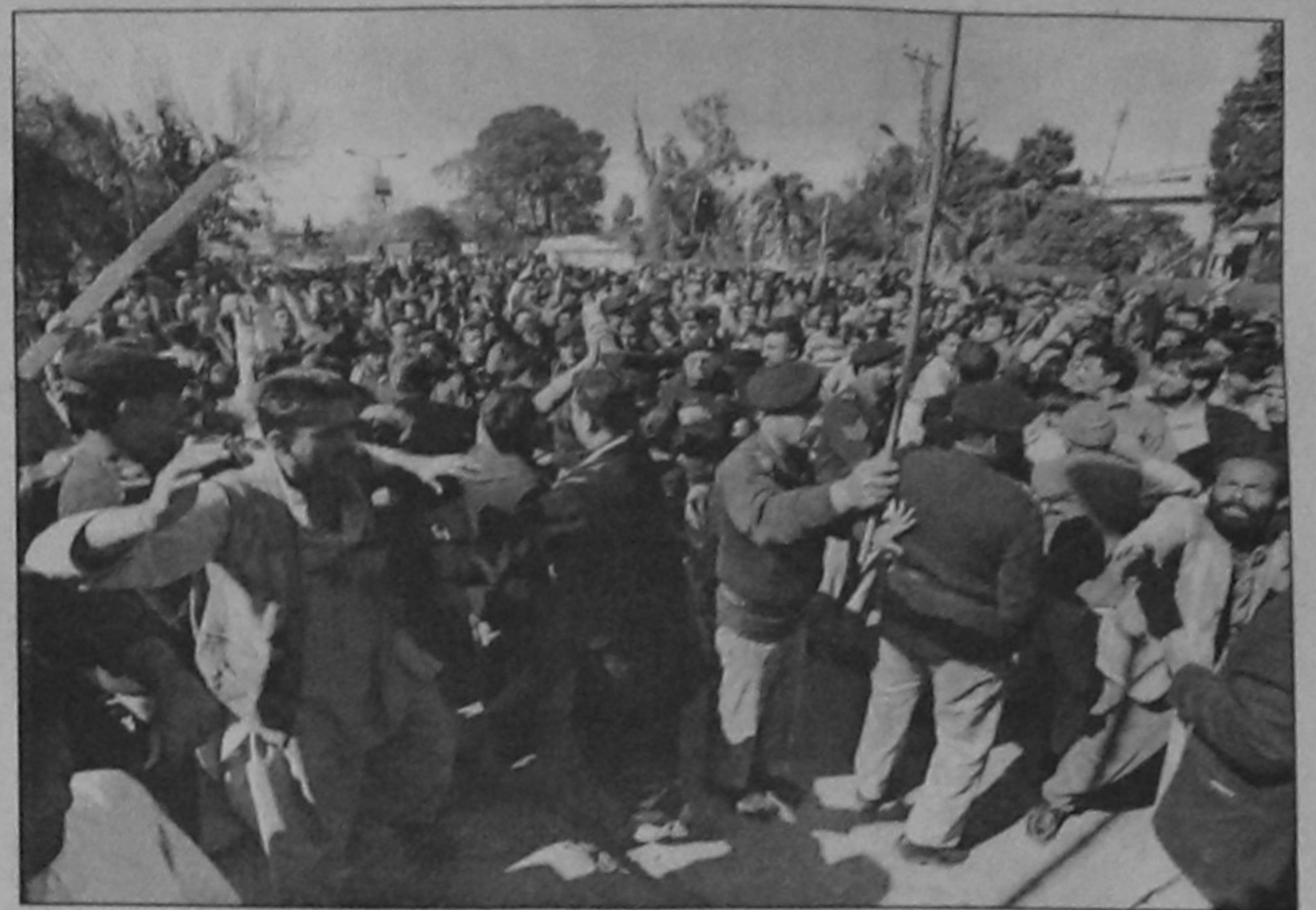
Pakistan's ruling Pakistan People's Party activists (L) scuffle with the supporters of former premier Nawaz Sharif as they prevent them from marching towards a memorial of former premier Benazir Bhutto in Rawalpindi yesterday. Thousands of protesters marched across Pakistan torching pictures of President Asif Ali Zardari as a nervous government put paramilitaries on alert and detained 30 lawmakers.

According to The Daily Times, a statement issued by the US State Department said: "The disqualification was an internal matter and Washington would not comment on it."