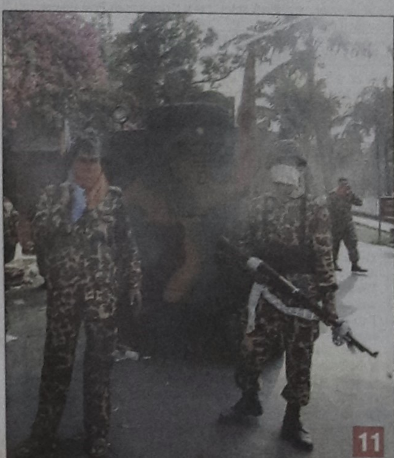
1) Members of Bangladesh Rifles take position inside BDR headquarters in the city yesterday. 2) Two women along with a child run for cover in Azimpur area during the gunfire. 3) Carrying a white flag, State Minister for LGRD Jahangir Kabir Nanak and Whip Mirza Azam walk towards the BDR headquarters to talk with mutineers. 4) Local people carry a man injured in the gunfire in Sat Masjid Road area. 5) A rickshaw carries a bullet-hit man to hospital. 6) Army men take position at Sat Masjid Road during the gunfire. 7) The New Market area near BDR headquarters becomes deserted during the gunfire. 8) Army men take position at Dhanmondi. 9) Local people gather near a drain at Hazaribagh after bodies of two BDR officials were found there. 10) Army men take position in Azimpur area. 11) Some mutineers take position at the gate of BDR headquarters.