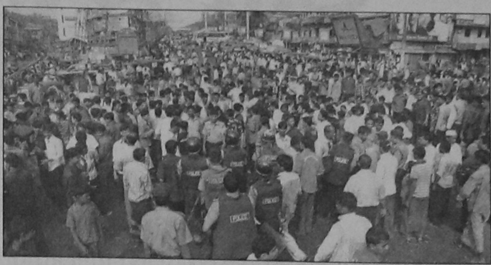
Garment workers put up a barricade on Dewanhat intersection in Chittagong city yesterday demanding payment of arrears.

State Minister for CHT Affairs Dipangkar Talukder visited him at the hospital.