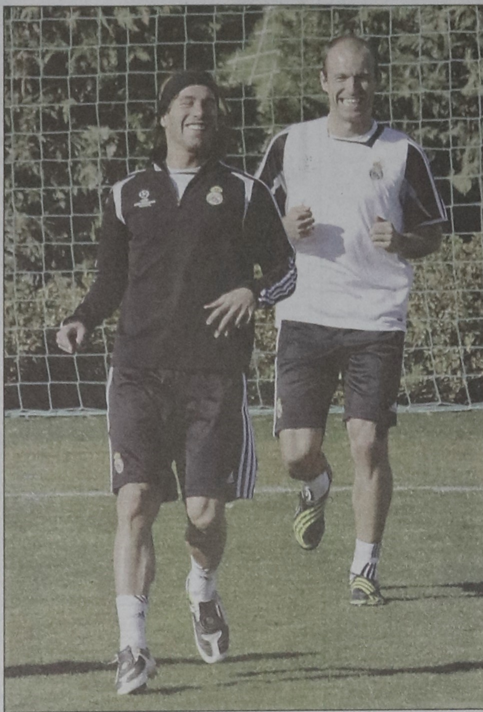
Real Madrid defender Sergio Ramos (L) and forward Arjen Robben smile during a training session in Madrid on Tuesday on the eve of their Champions League clash against Liverpool.

Manchester United have said they are confident of improving on the AIG deal, which began in 2006.