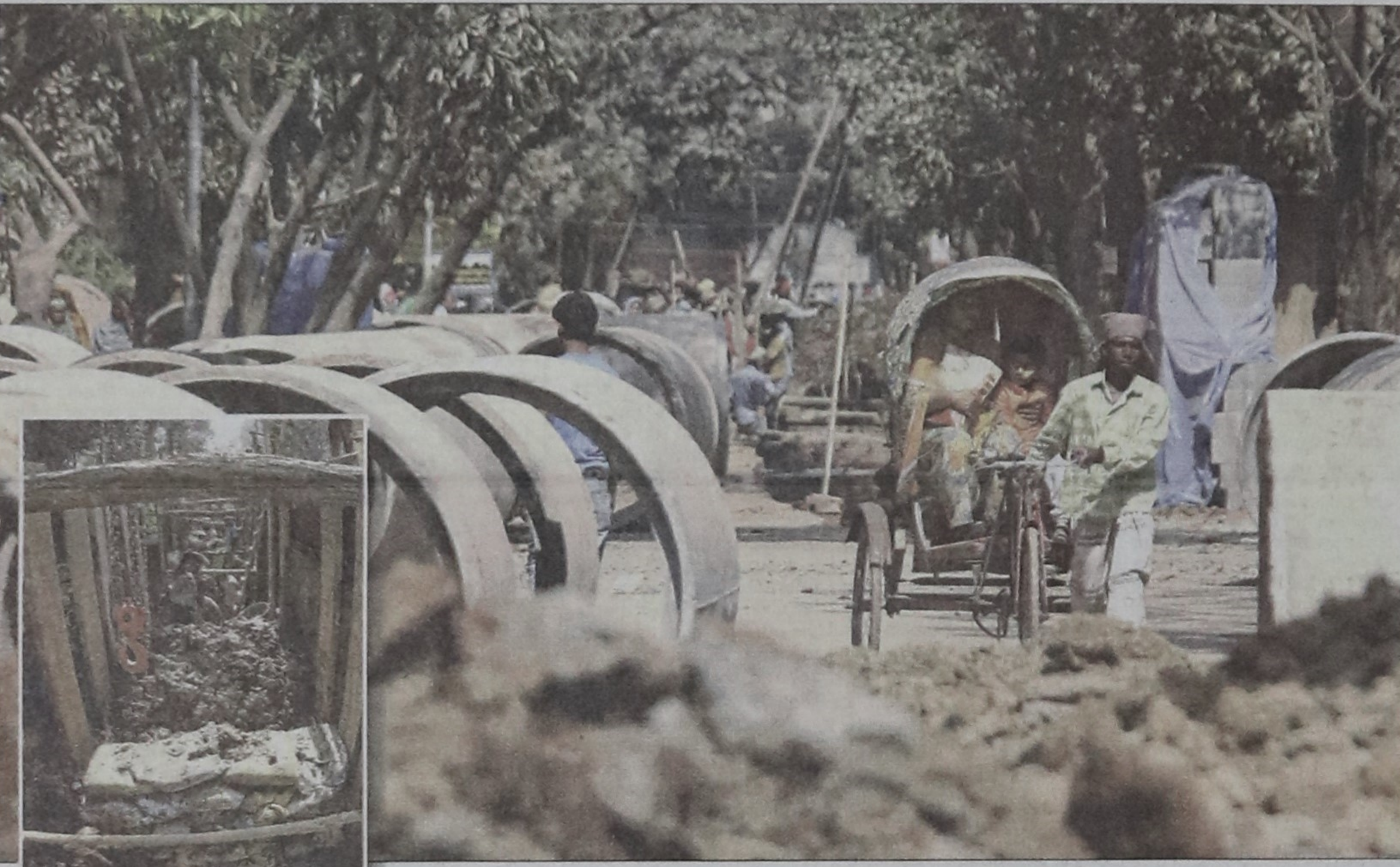
Dhaka Wasa in its bid to install storm-water drainage system rendered this street in Uttara Sector-7 almost unusable for city dwellers. Inset, the long trench it dug in the street to install pipes.