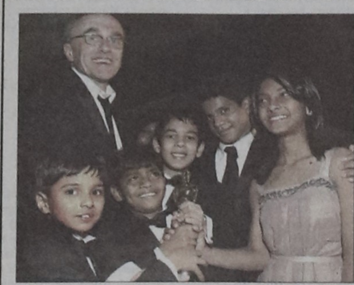
Director Danny Boyle, left, and child actors of Slumdog Millionaire hold the Oscar at the 81st Academy Awards yesterday. Right, winner of Best Original Song and Best Original Score AR Rahman.