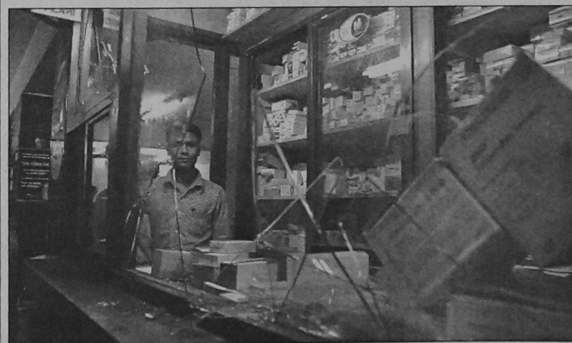
A mob vandalises Padma General Hospital, a private clinic, in the city yesterday after a day labourer died in the clinic due to alleged negligence of doctors.