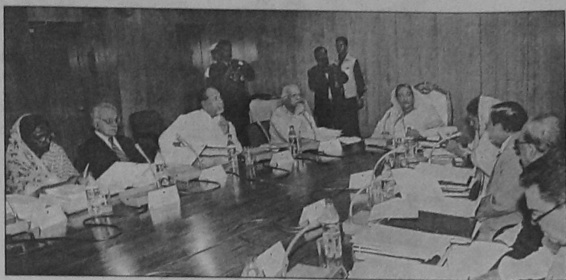
Prime Minister Sheikh Hasina presides over a cabinet meeting at the conference room of the cabinet division in the city yesterday. (Story on Page 1)