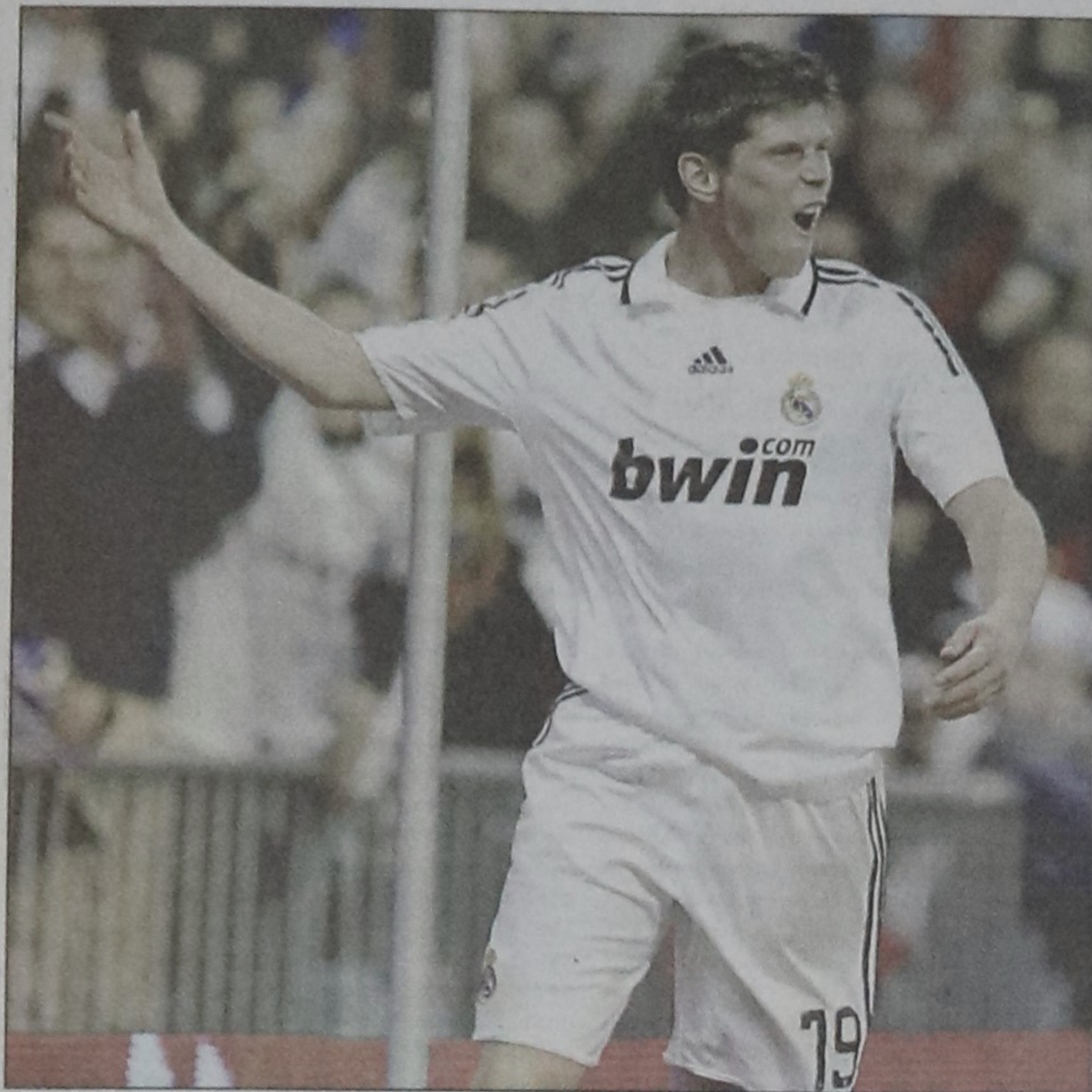
WILL THE TIDE TURN? Real Madrid striker Klaas Jan Huntelaar (L) is delighted at scoring a brace against Real Betis just as Espanyol midfielder Ivan de la Pena (R) runs off to celebrate his two-goal haul against Barcelona during their respective Primera Liga games on Saturday. Huntelaar was instrumental in Real's 6-1 win at the Santiago Bernabeu while De la Pena hit an exquisite winner at Nou Camp to settle the Catalan derby as Real closed in on runaway leaders Barca.