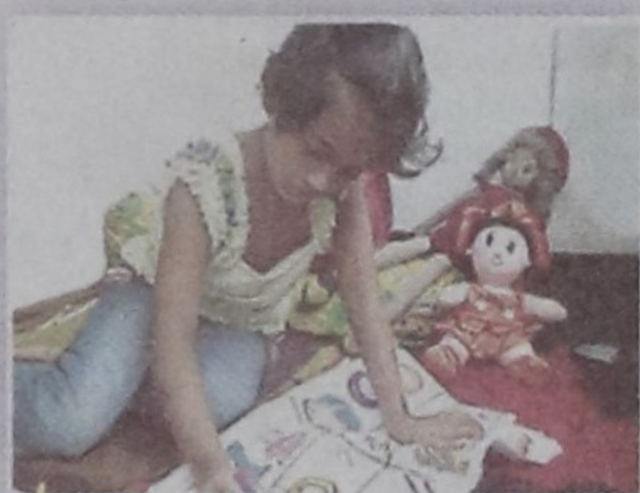
Education Savings Scheme