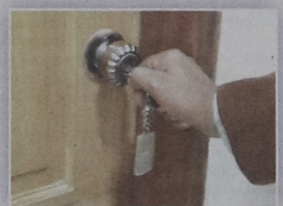
Flat Loan Scheme