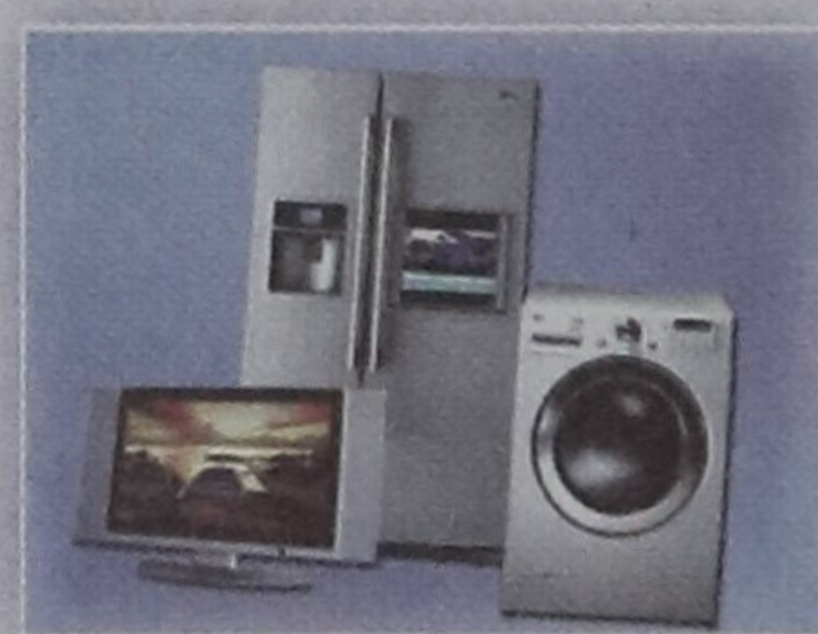
Household Durables Loan