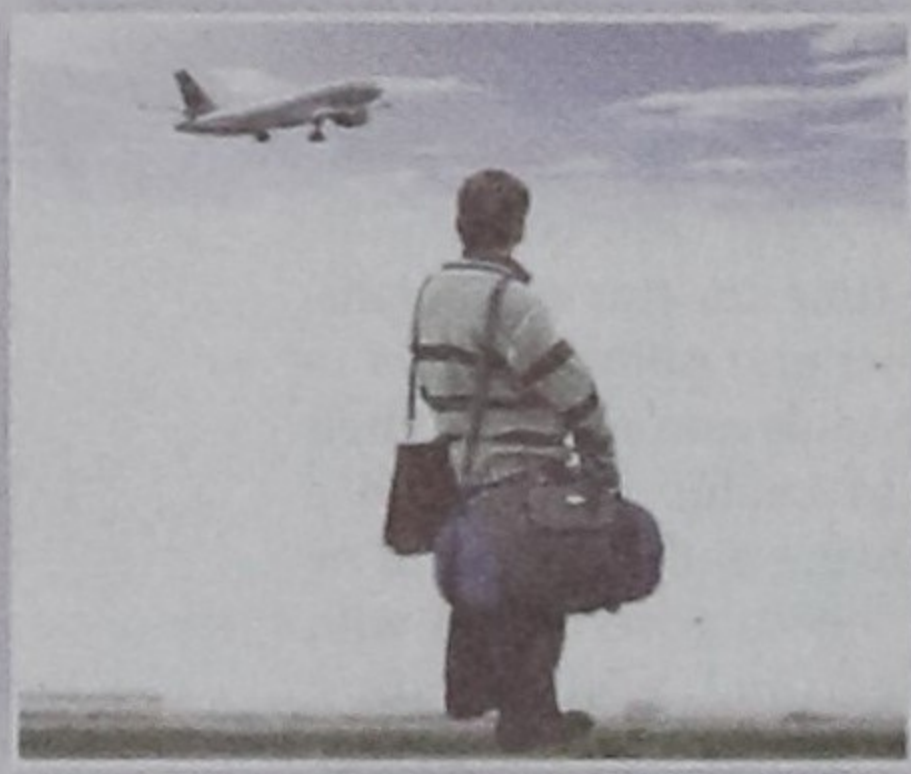
Non-Resident Credit Scheme