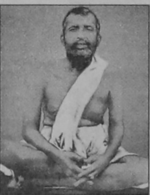
Birth anniversary of Ramakrishna on Feb 27

Following the submission of the charge sheet, the magistrate issued an arrest warrant against the accused.