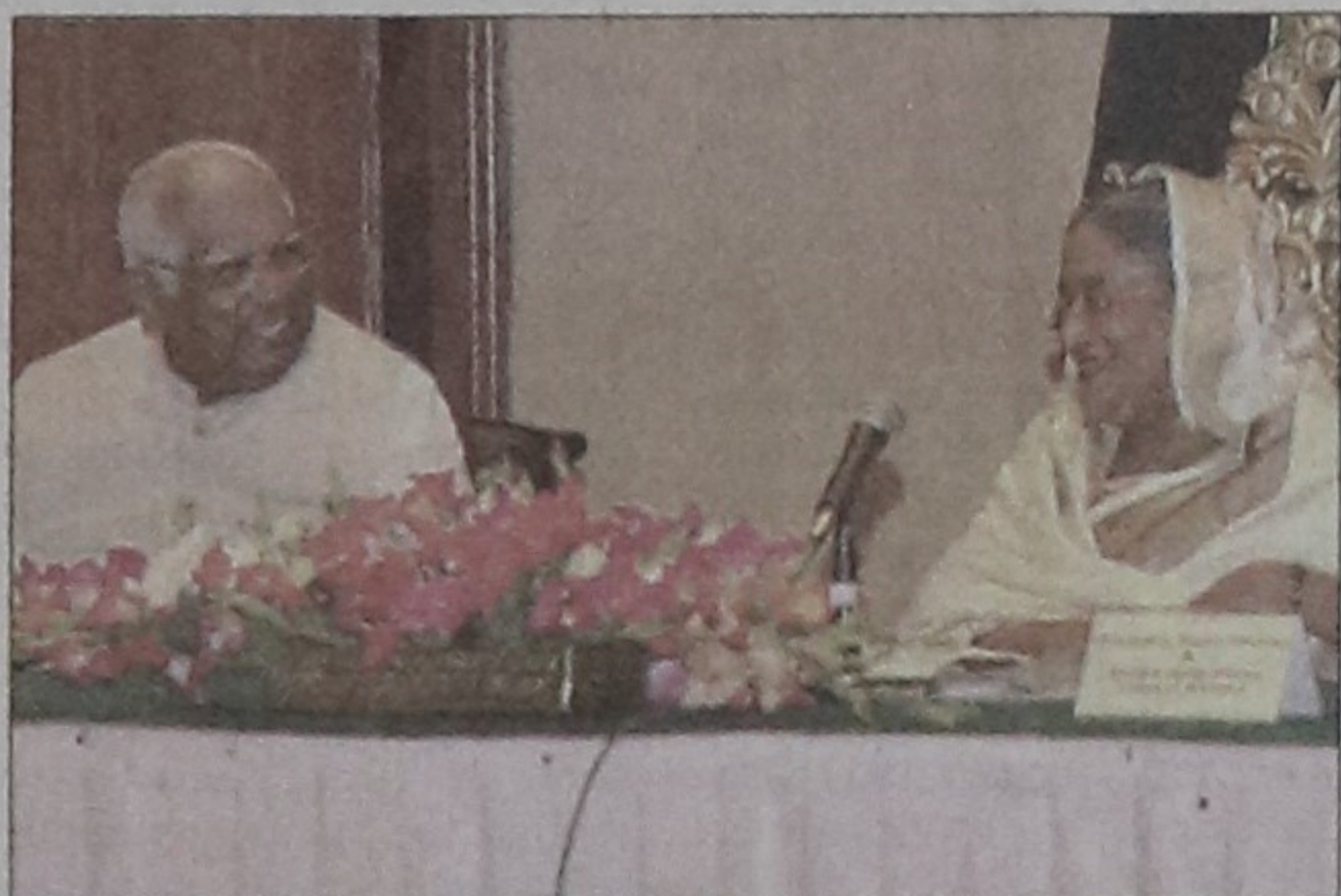
Prime Minister Sheikh Hasina and Indian Lok Sabha Speaker Somnath Chatterjee at the orientation programme for newly-elected members of Jatiya Sangsad at Hotel Sonargaon yesterday.