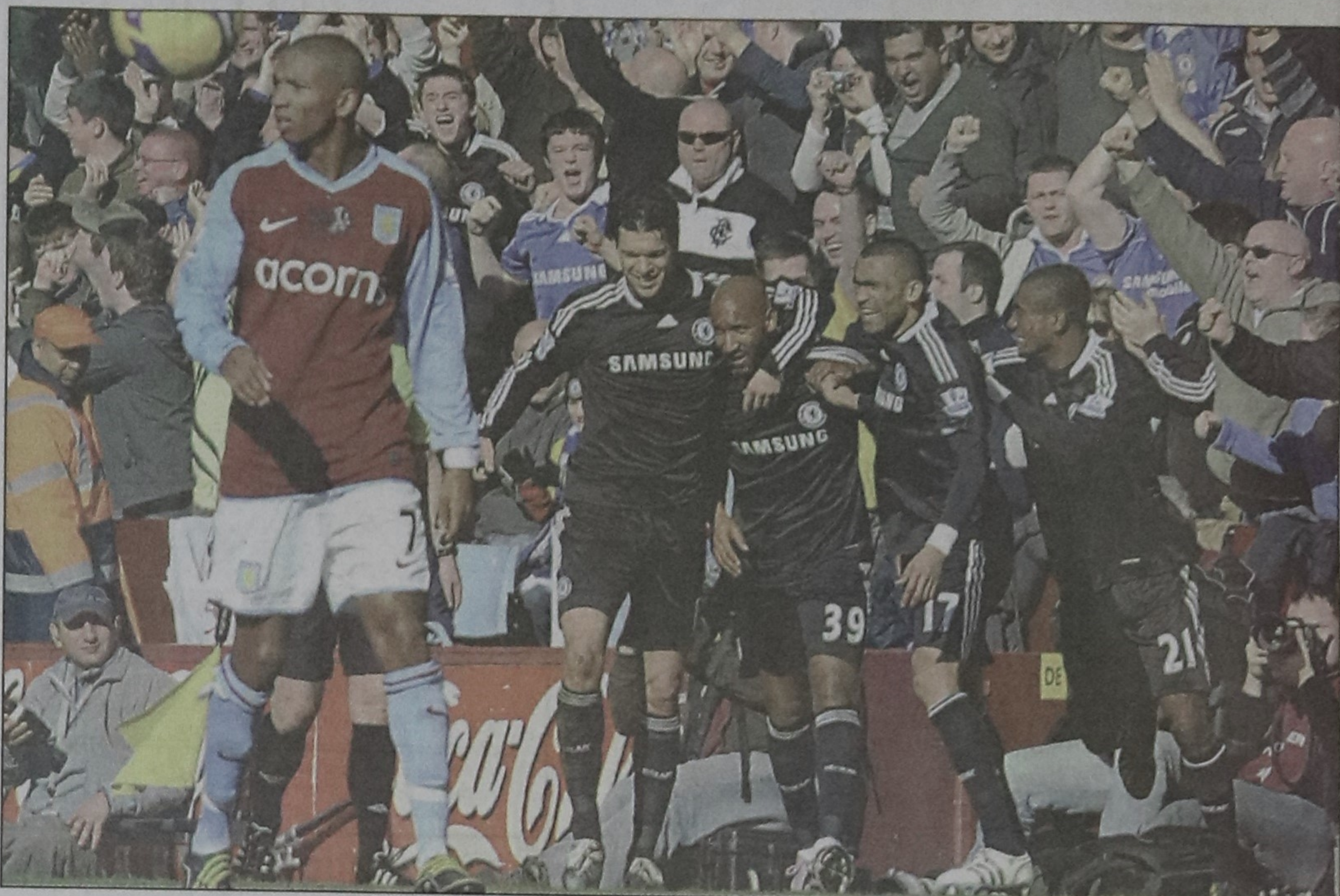
Chelsea striker Nicolas Anelka (3rd from L) celebrates with teammates after scoring the all-important goal against Aston Villa during their Premiership encounter at Villa Park on Saturday.