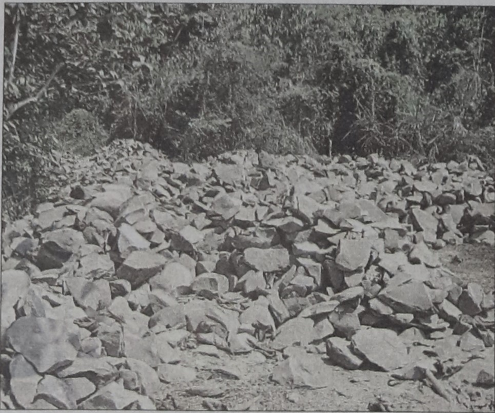
Extracted rock stockpiled at Nanchhari in Khagrachhari district where unscrupulous traders have continued illegal collection and selling of rocks, posing threat to environment and depriving the government of huge revenue.

This correspondent witnessed huge stockpiles of hill rocks at Nunchhari, Gagrachhari, Gamaridala, Champaghat and