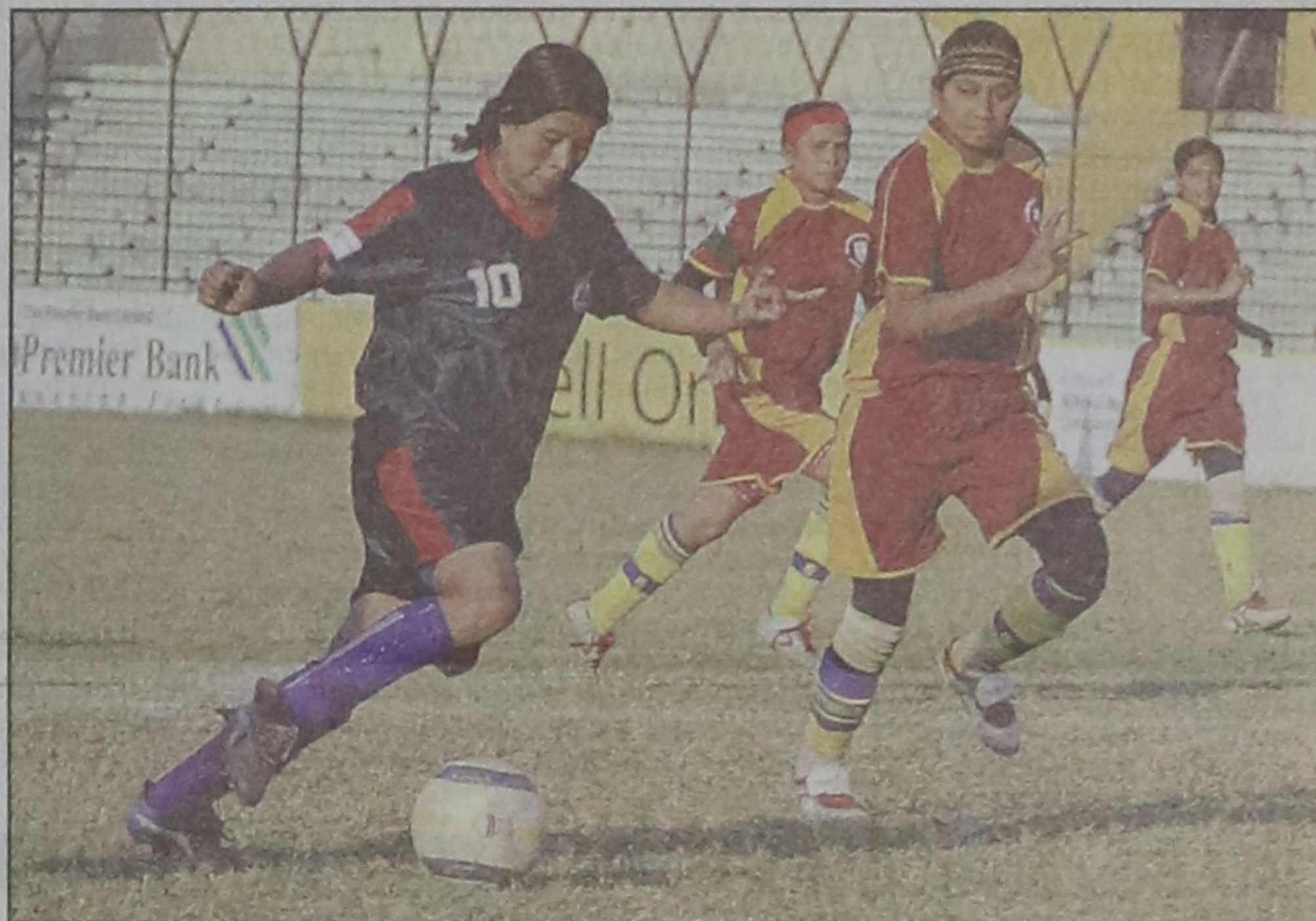
A mid-pitch action of the Citycell National Women's Football Championship final round match between Rajshahi and Bangladesh Ansar at the Bangabandhu National Stadium yesterday.