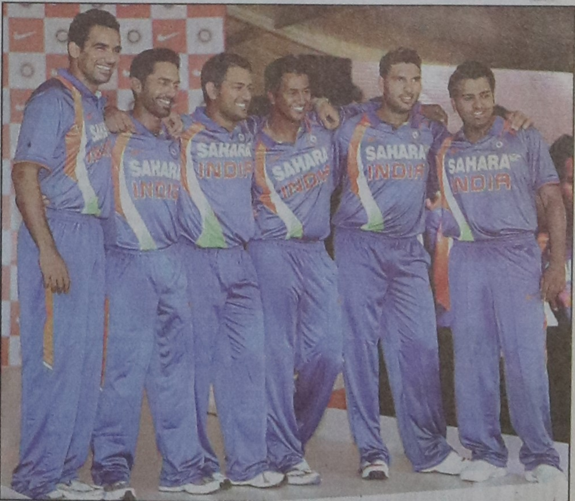
Indian cricketers led by captain Mahendra Singh Dhoni (3rd from L) pose during the launch of a new team kit in Mumbai on Wednesday ahead of their tour to New Zealand for two Twenty20 internationals, five one-day matches and three Tests.