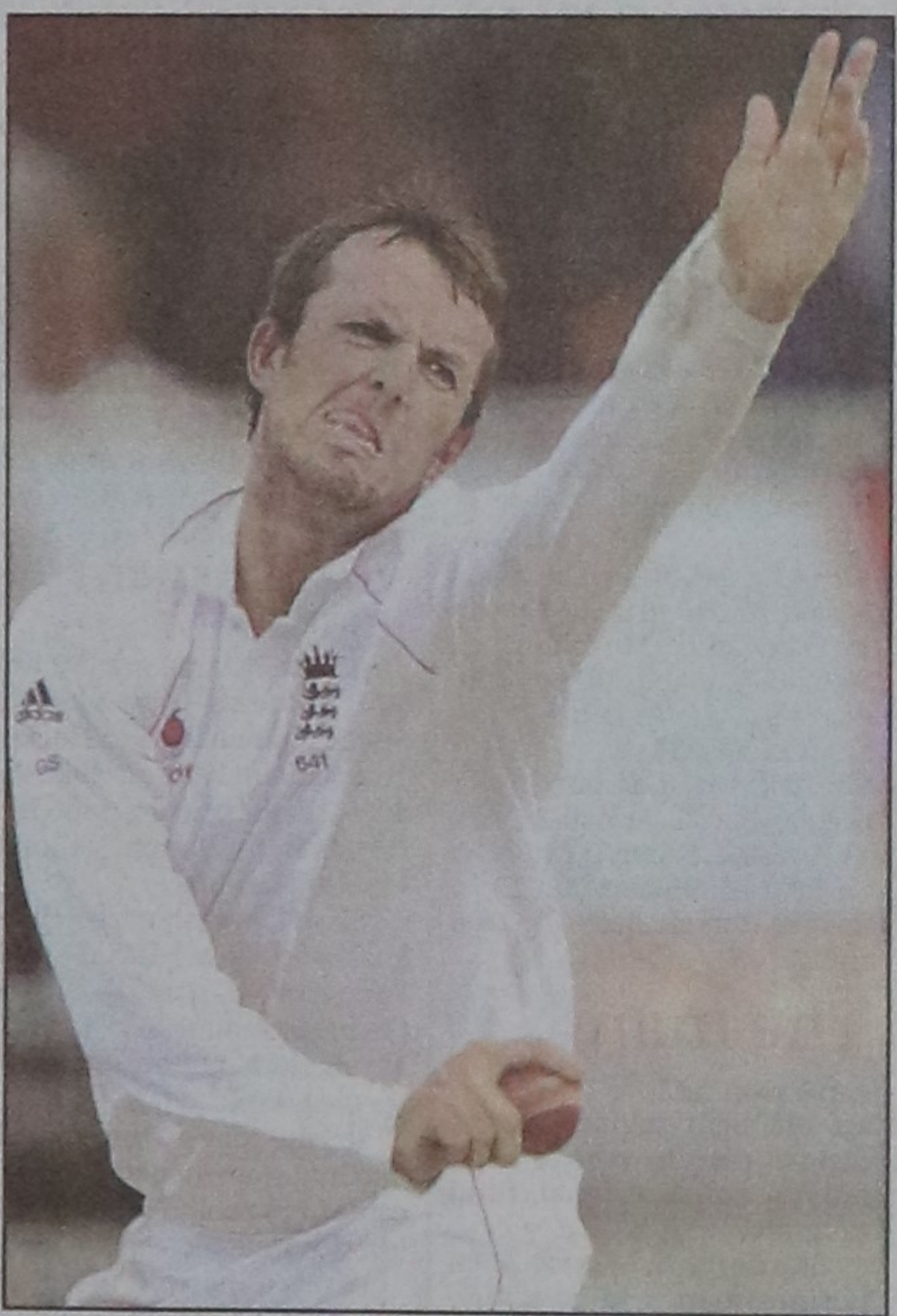
England off-spinner Graeme Swann is in his delivery stride during the third day of the third Test against West Indies at the Antigua Recreation Ground (ARG) in St John's on Tuesday.