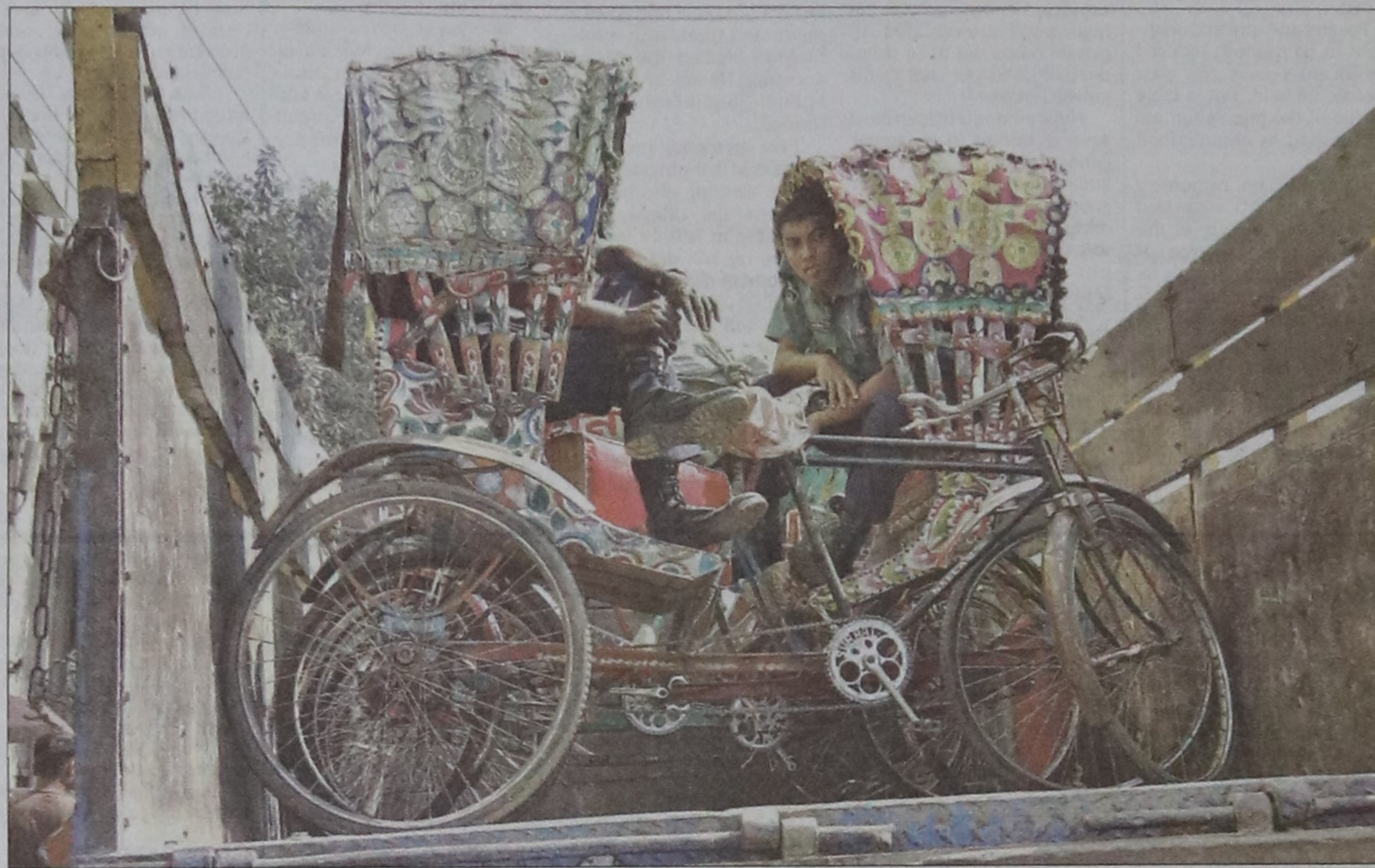
Two traffic constables take a break from work and rest in seized rickshaws on a truck in city's Shabbagh area yesterday. The rickshaws were seized during a drive against rickshaws peddling without licences in the city.

STAFF CORRESPONDENT Prime Minister Sheikh Hasina yesterday launched a blistering attack on past BNP-Jamaat-led alliance government accusing it of politicising the entire administration and said her government is facing problems for the "politicised" administration. "They politicised everywhere ranging from the civil administration and armed forces to the judiciary. Efficient officials were removed for the politicisation," Hasina told the House during a question-answer session. She said the new government is facing problems as inefficiency and reluctance of SEE PAGE 2 COL 1