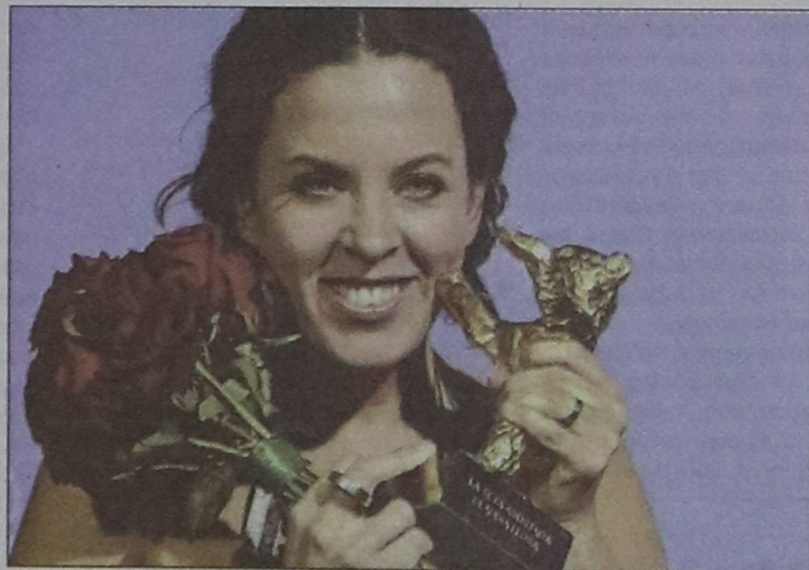
Golden Bear winner Claudia Llosa.

In the film, the main character Fausta is ill with a disease contracted from her mother's breast milk referred to as "the milk of sorrow." This however is not a viral infection, it's a condition that only affects women who were abused or raped during the Peruvian authorities' long war against