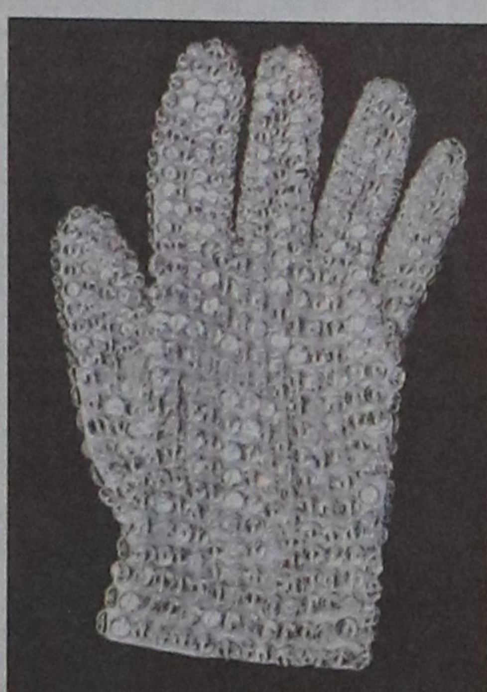
Michael Jackson is parting with more than 2,000 personal items.