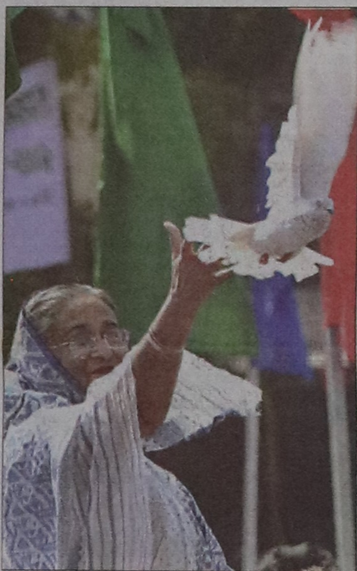
Prime Minister Sheikh Hasina, left, releases doves during the reunion of Bangladesh Chhatra League at Paltan Maidan in the capital yesterday to mark the organisation's 61st founding anniversary. Scuffles break out between members of different units of BCL, right, during the reunion.