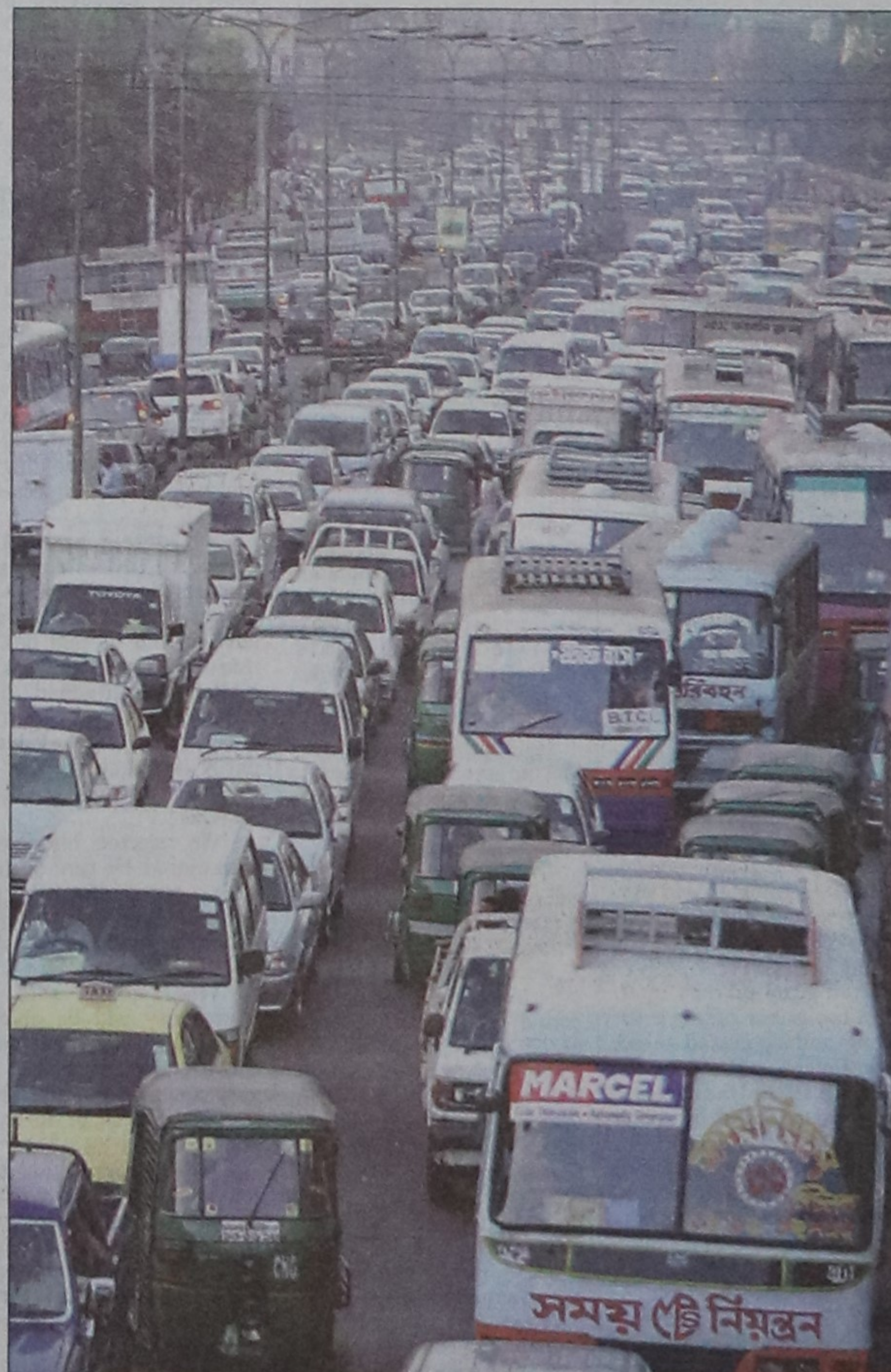
Traffic nightmare continues on Kazi Nazrul Islam Avenue in the capital as all vehicles grind to a halt near Bangla Motor intersection yesterday.