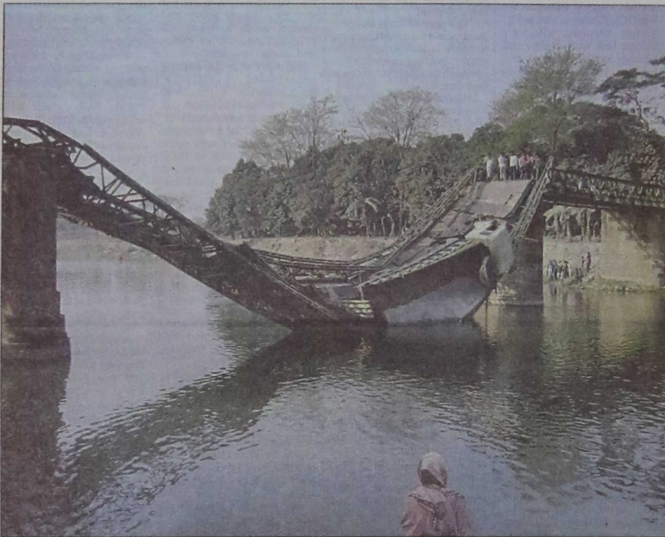
Road communication between Dinajpur and Parbatipur was snapped Monday after this bridge on the Atrai River at Matharganj collapsed as a sand-laden truck was crossing the bridge.