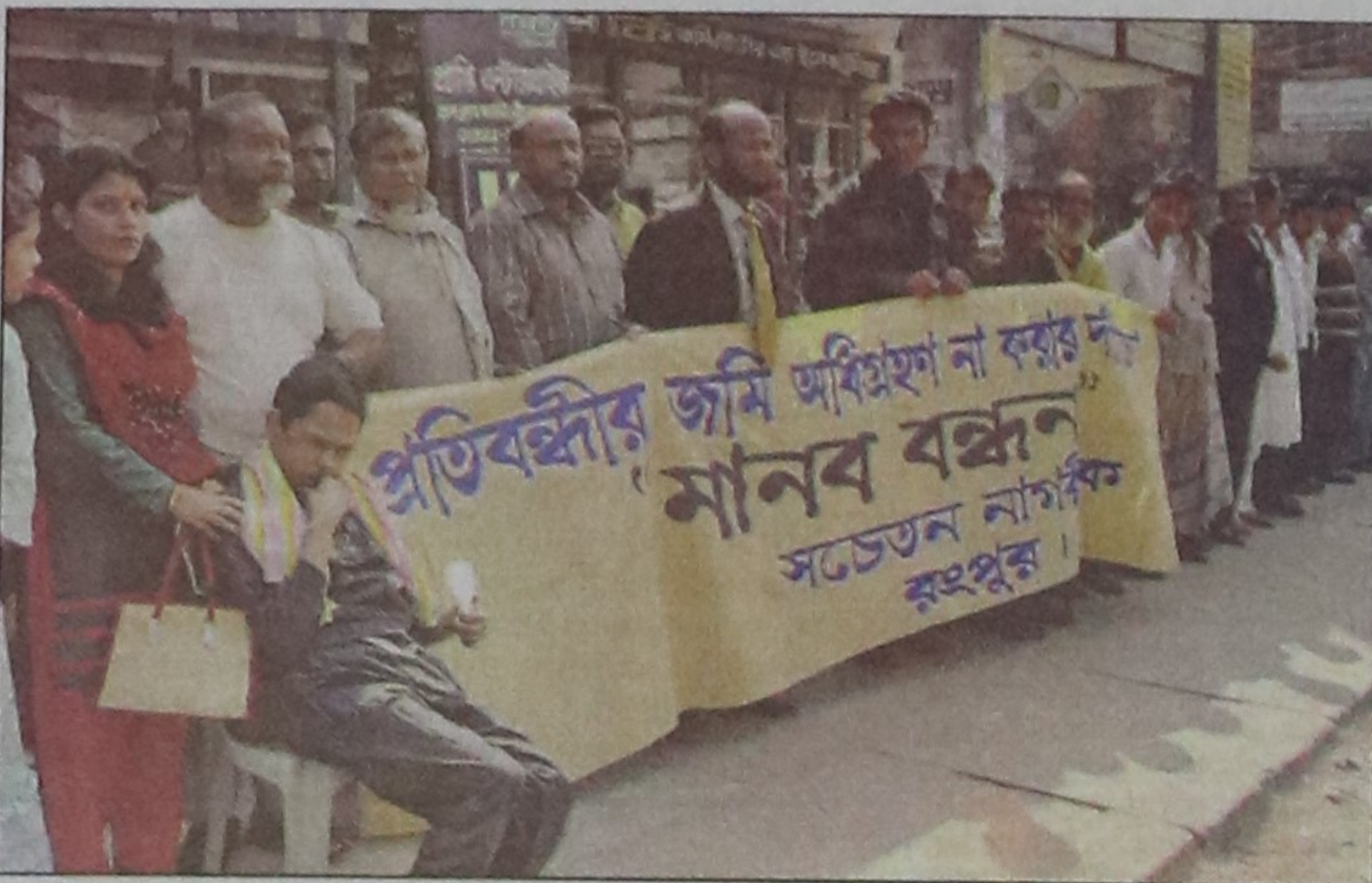
Sachetan Nagarik forms a human chain in front of Rangpur Press Club yesterday demanding withdrawal of the decision to acquire land of a family consisting six physically challenged persons.