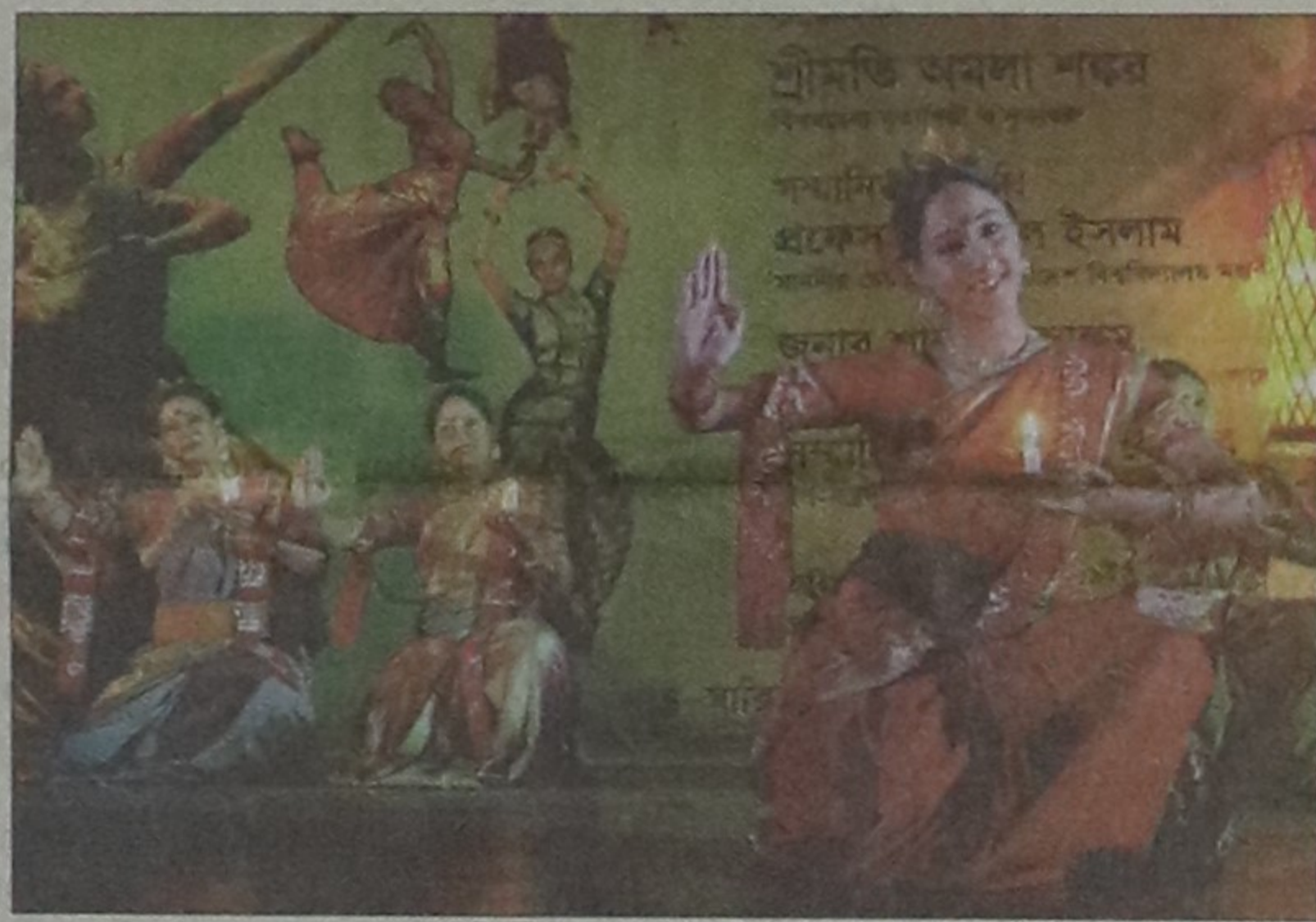
A dance performance at the programme.

"I've just been sincere to my art, and practiced it with passion. The