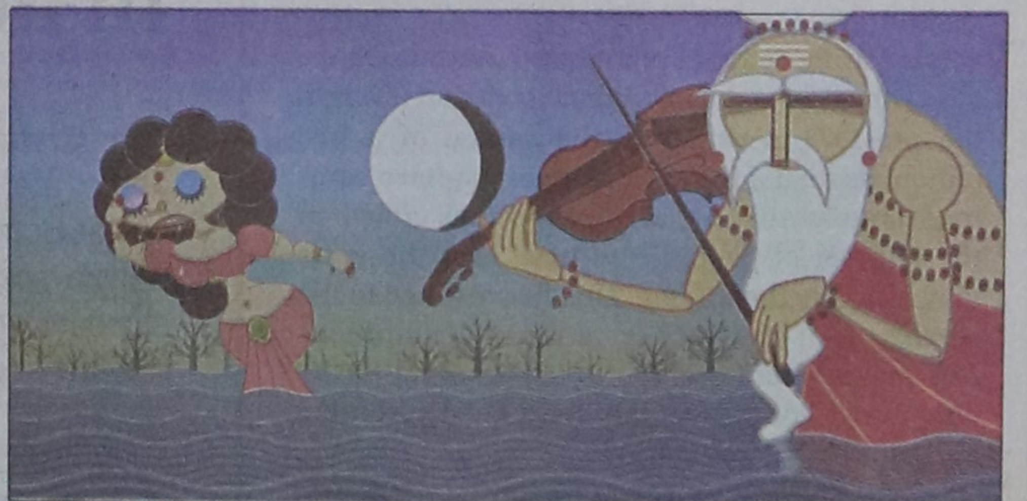
Crying a river: a scene from the animated feature "Sita Sings the Blues."