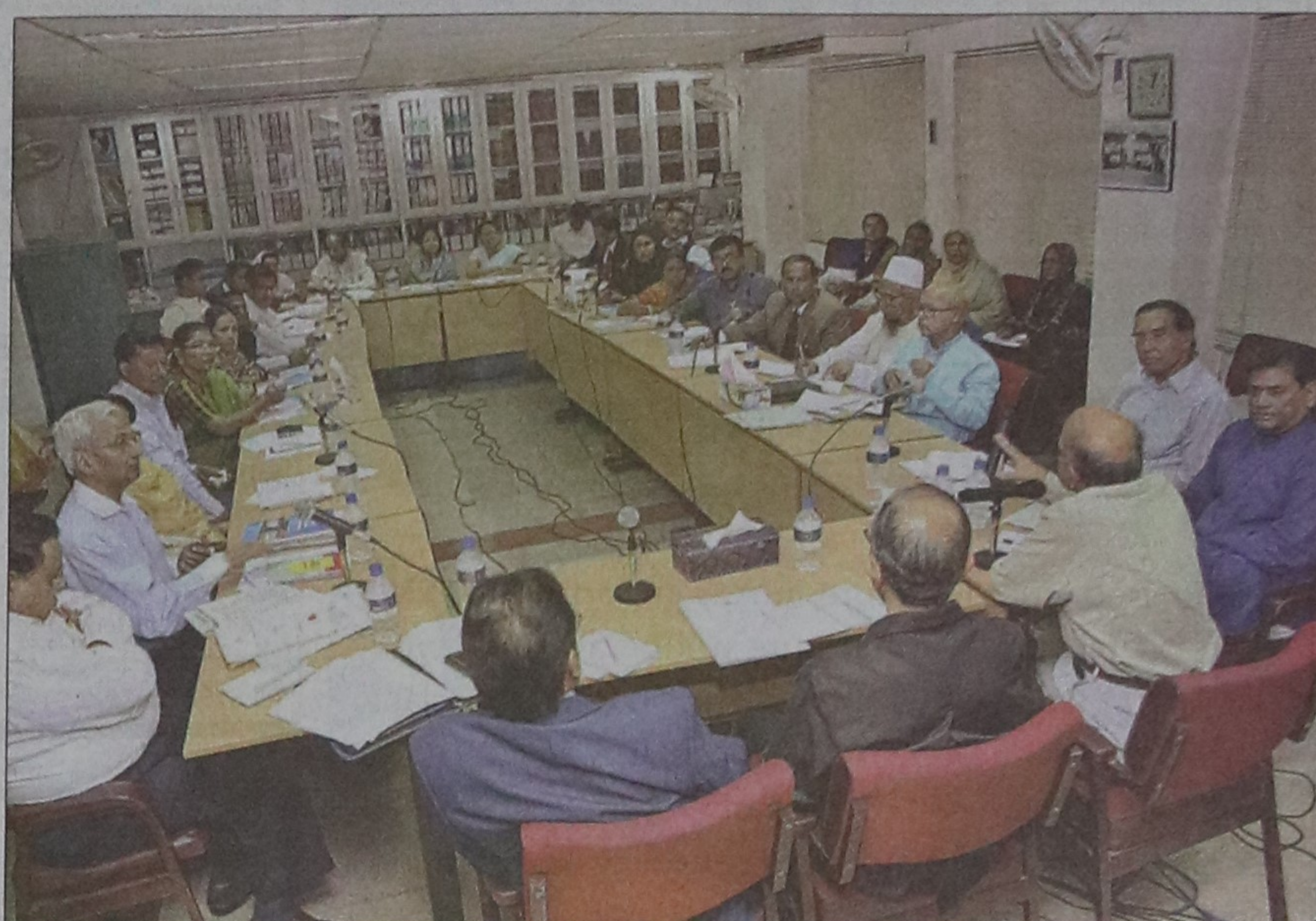
Participants at a roundtable titled 'Making Upazila Parishad Operational: Challenges and Prospect', organised by The Daily Star at the conference room of its office in the city yesterday. (Story on Page 1)

He said the Superior Selection Board (SSB) will now hold meetings regularly so that promotion is given on regular basis and there should be no backlog of such cases.