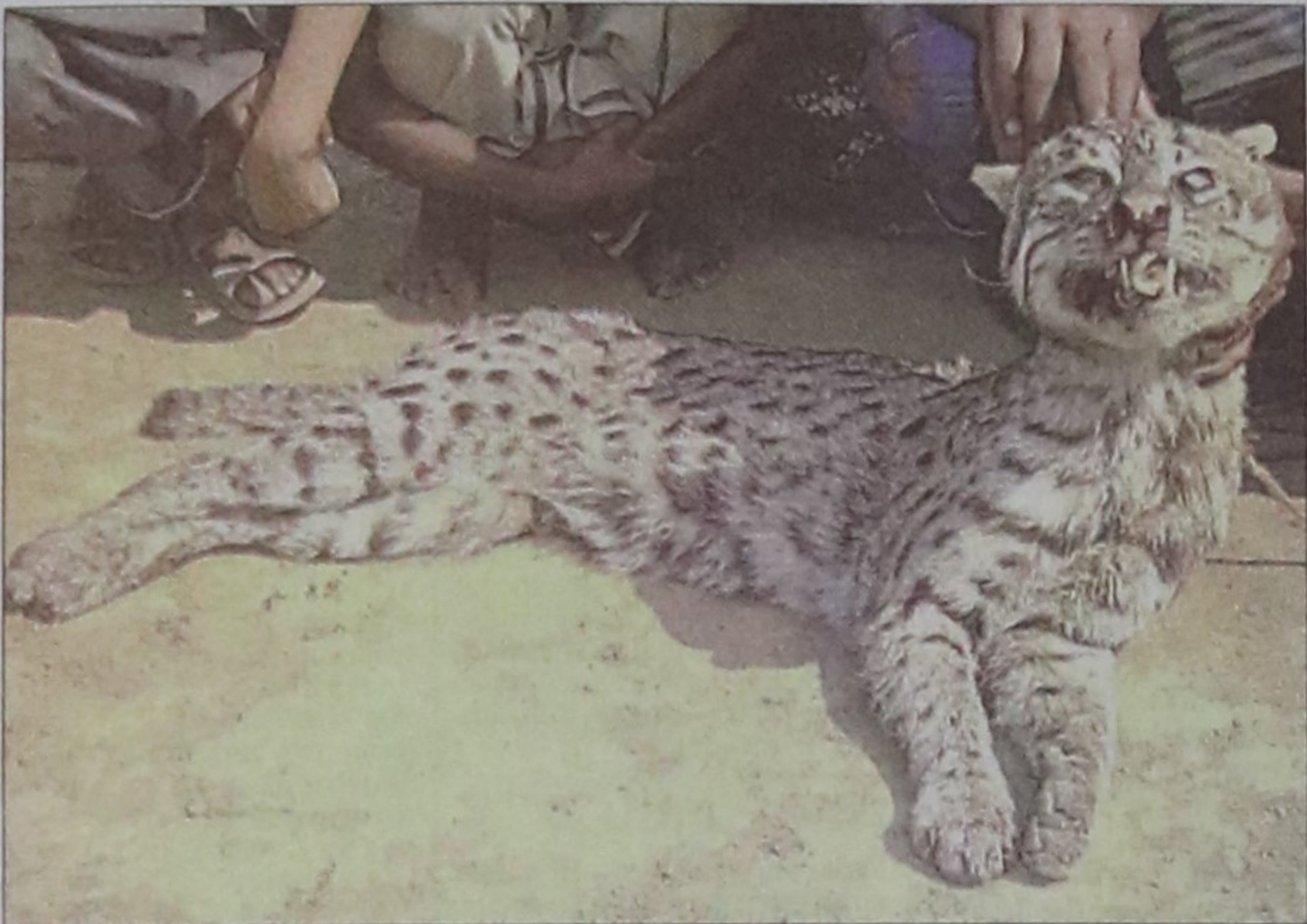
This fishing cat was beaten to death at Bhourghata of Gouranadi in Barisal Sunday evening after villagers trapped it in a betel-leaf plantation.