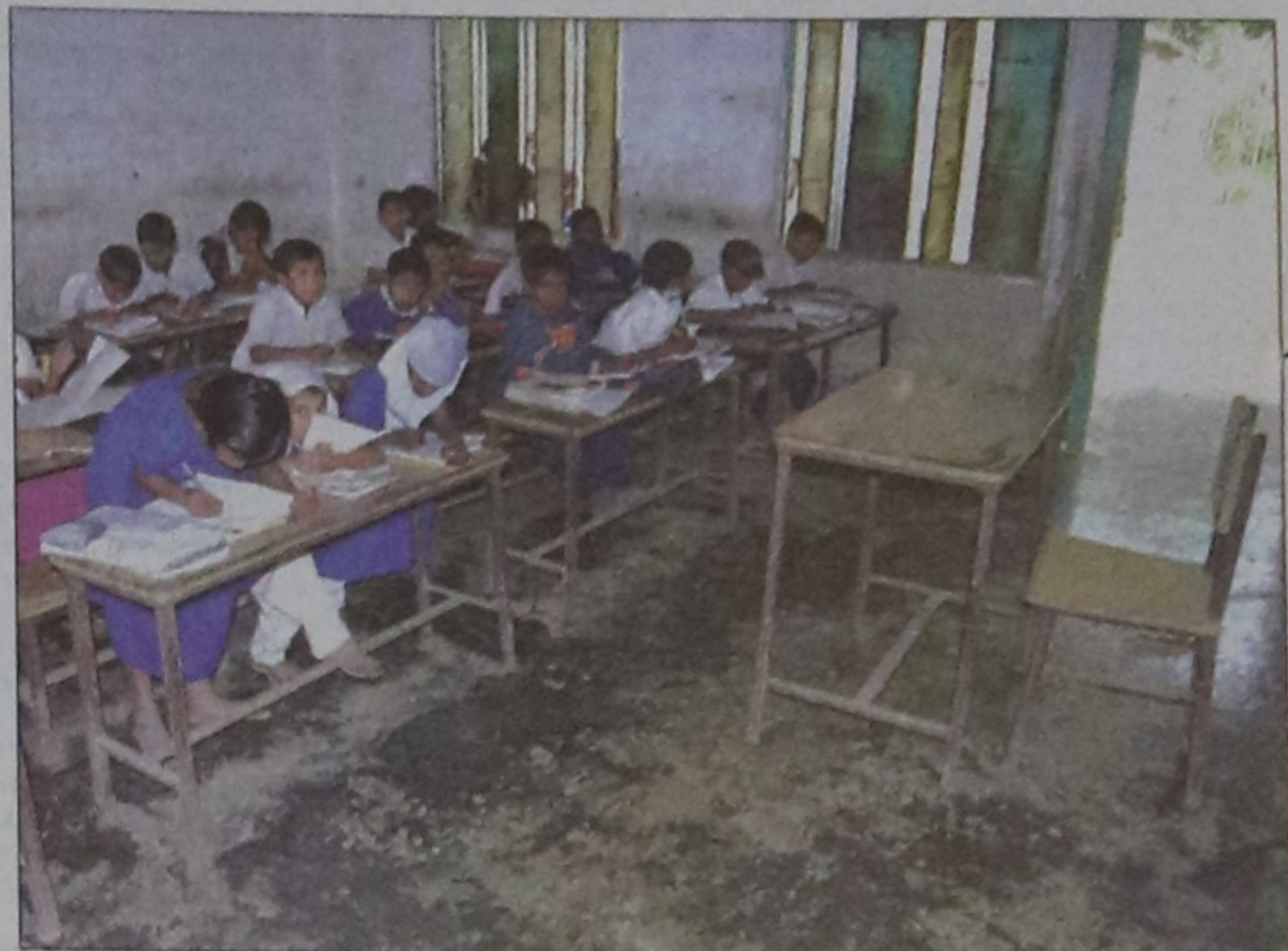
Students of Godagari Government Primary School in Sariakandi, Bogra, are doing class work without the teacher who had to leave for another class as the school has only two teachers for five classes.

"It is a tremendous challenge for the government because millions of children