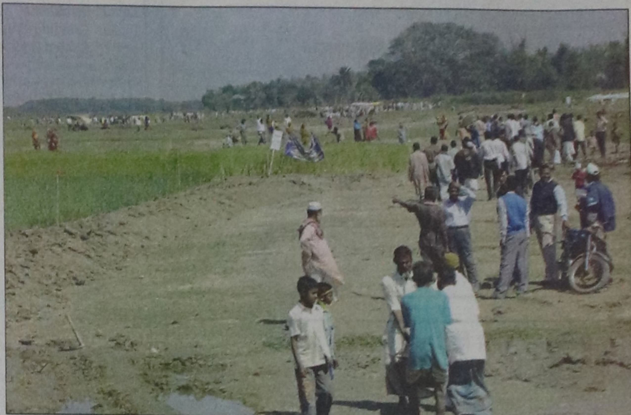
UNITY IS STRENGTH: Villagers rendering voluntary service to construct a five-kilometre road from Notun Kahela to Dimukhi Bazar in Warshi union in Mirzapur in Tangail under 'Shouhardo' project of CARE Bangladesh. Five thousand villagers including women and students of 19 villages joined hands to complete the work by today. About 40,000 villagers would be benefited on completion of the road.