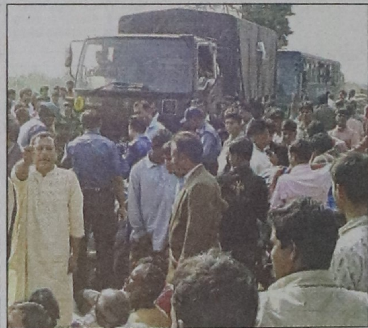
Farmers block Dinajpur-Rangpur highway yesterday demanding adequate water supply for Boro cultivation.