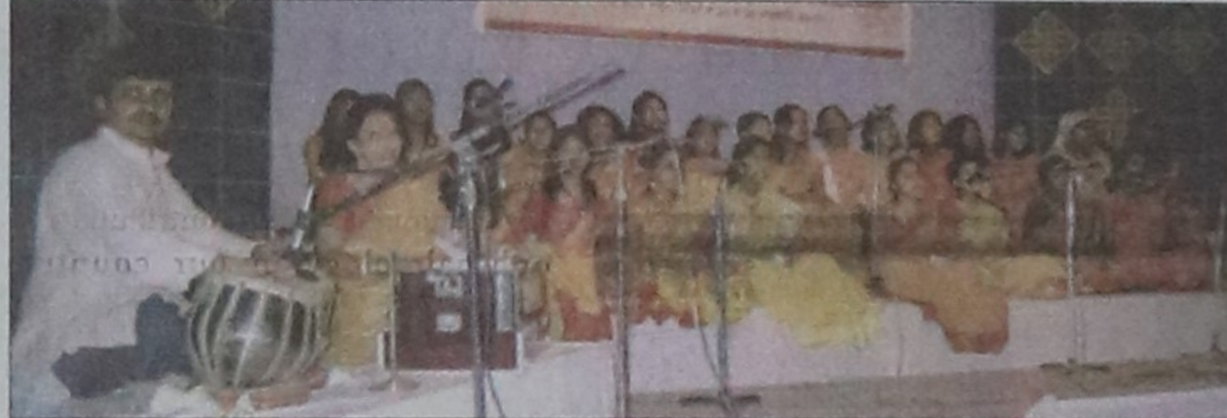
Artistes perform at biennale conference of Jatiya Rabindra Sangeet Sammilan Parishad's Comilla unit.