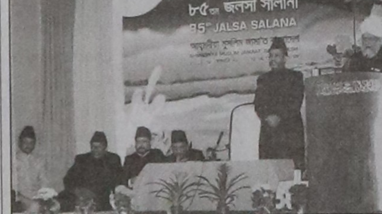
Participants in the 85th Annual Convention of Ahmadiyya Muslim Jamaat, Bangladesh that concluded in the city on Sunday.

Rotary Dhaka The regular meeting of Rotary Club of Dhaka will be held. Venue: Sonargaha Hotel. Time: 5:30pm.