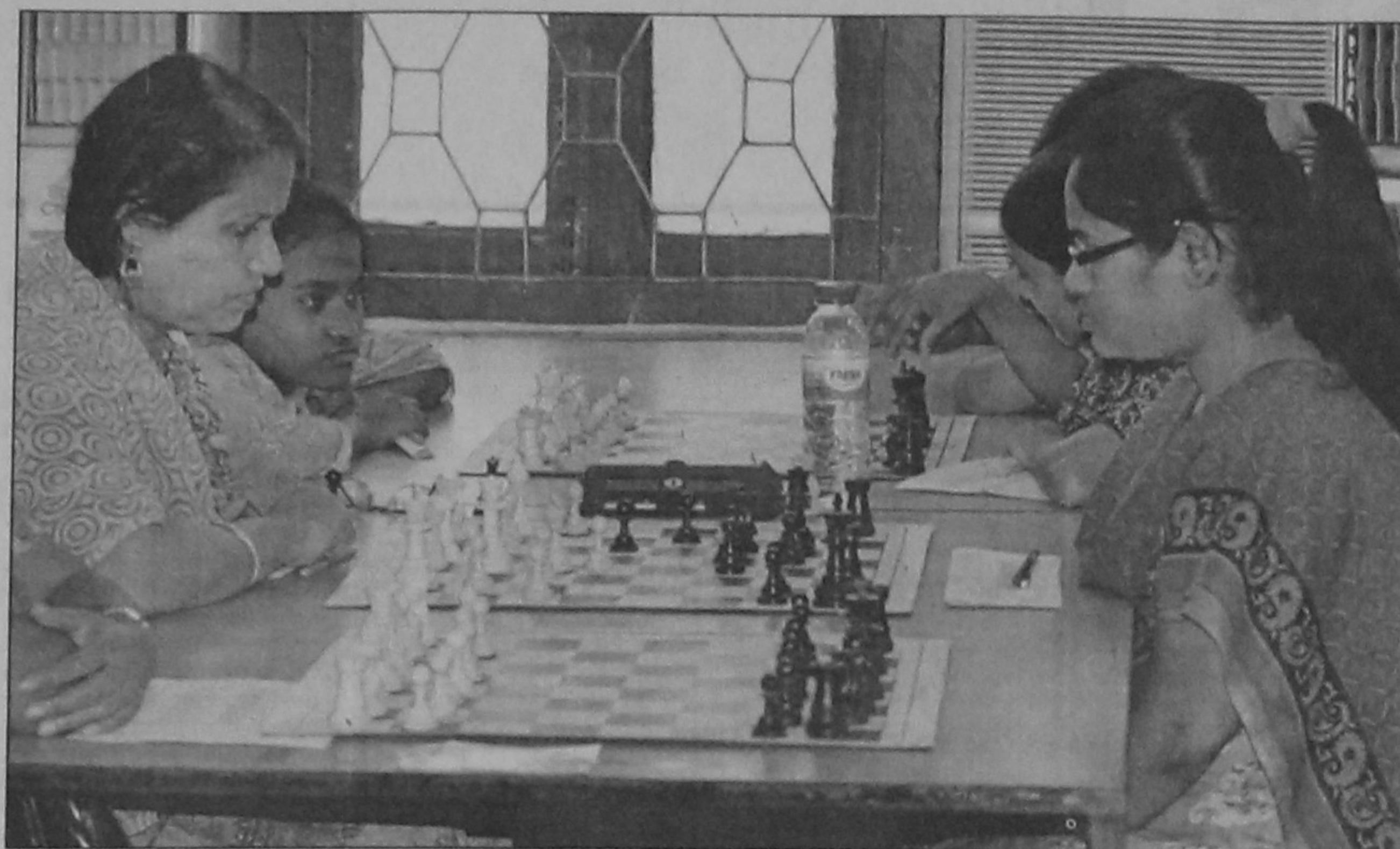
Scene from yesterday's third open FIDE Rating Women Chess Tournament at the chess federation hall room.