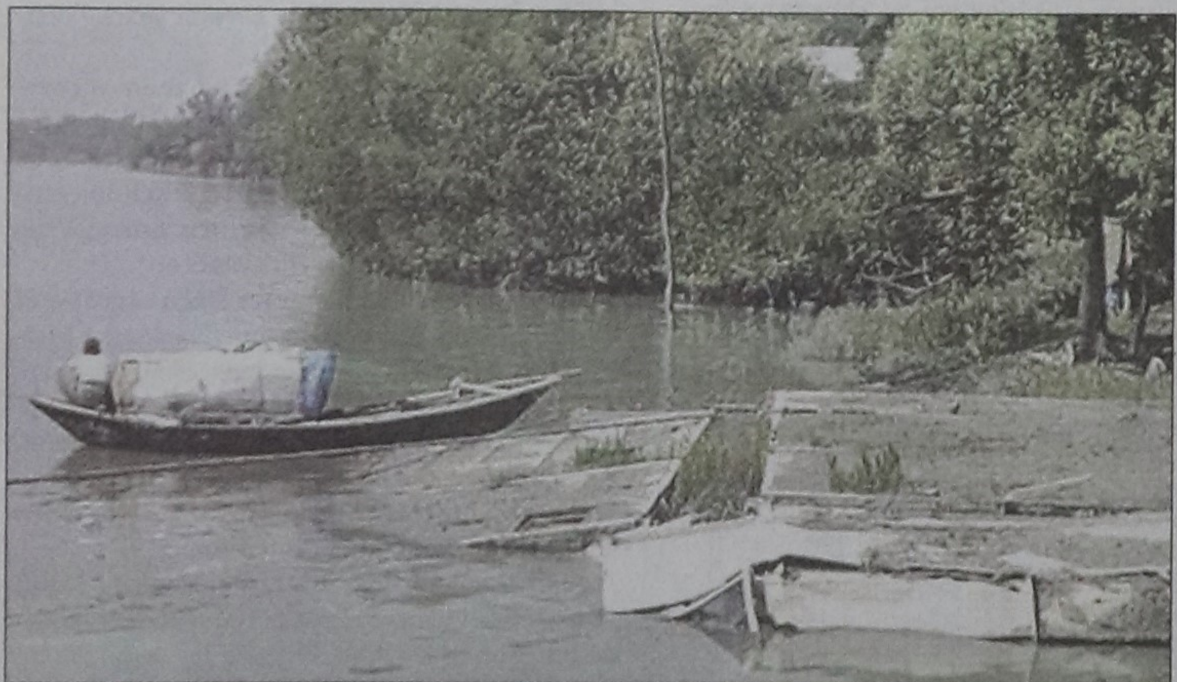
Left abandoned for seven years on the Andharmanik River in Kalapara upazila, valuable parts of this ferryboat have gone missing while the authorities are apparently reluctant to save the remaining parts.

"We are not harassing any innocent people. We are looking for the culprits involved in the clash." Said OC of Ishwardi Police Station.