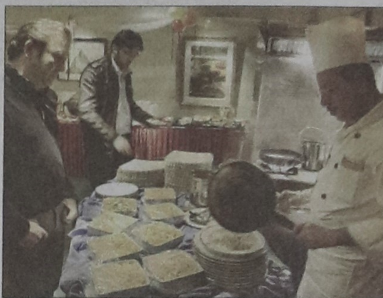
A six-day Italian food festival began at Hotel Sarina in Dhaka yesterday. More than 50 varieties of authentic Italian foods will be served during the festival.

The drive would continue throughout the month, Coast Guard sources said.