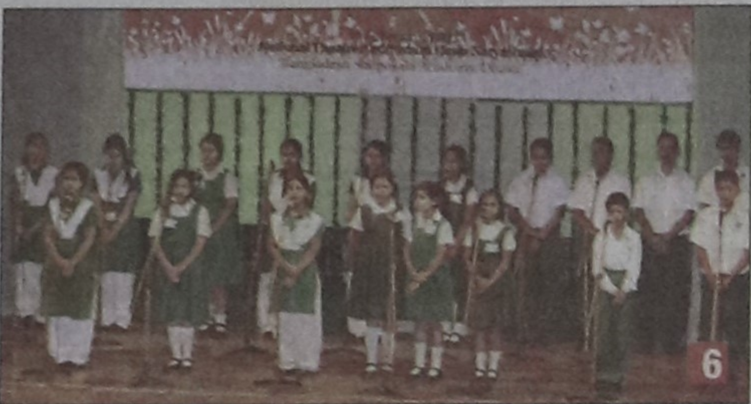
Students of renowned English medium schools perform at a cultural programme organised by The Daily Star at National Theatre Auditorium at Shilpakala Academy in the city yesterday. 1. BIS School; 2. Oxford International School; 3. Sea Breeze School; 4. Maple Leaf School; 5. BIT School; 6. Green Gems International School; 7. Playpen School; 8. Sunnydale School.