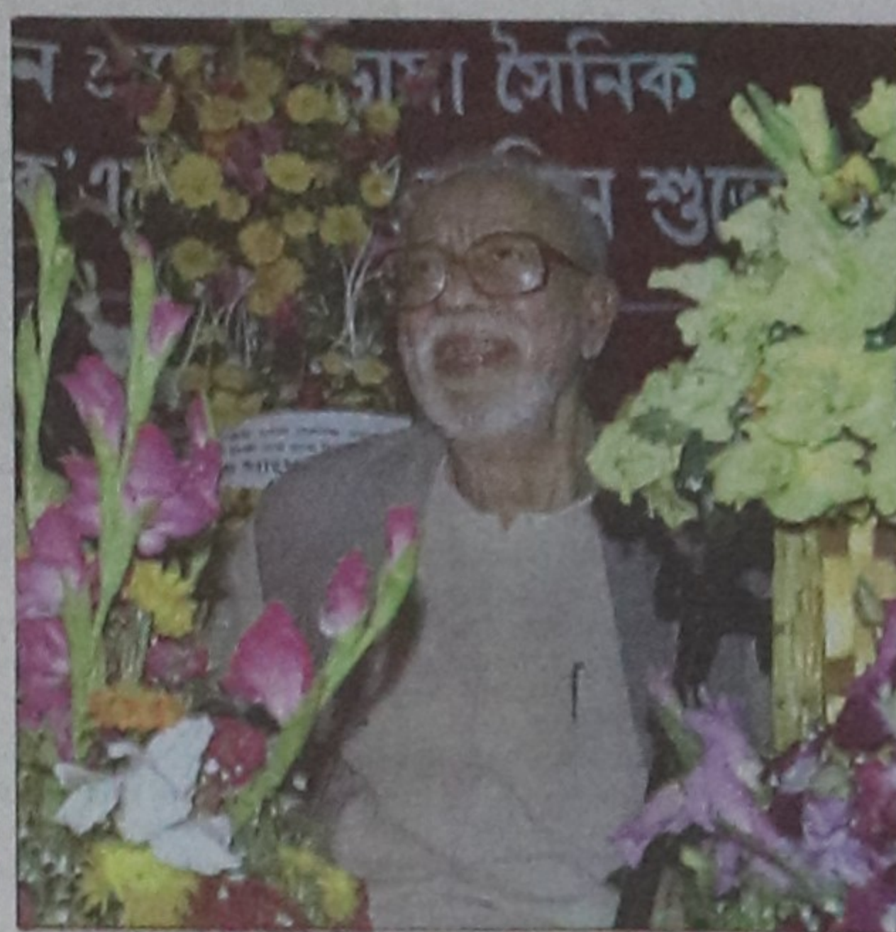
This photo of a smiling Language Movement hero Gaziul Haque with bouquets was taken on Puhela Falgun last year, his 81st birthday. This year on his birthday the ailing leader is being treated at the ICU of Square Hospital.