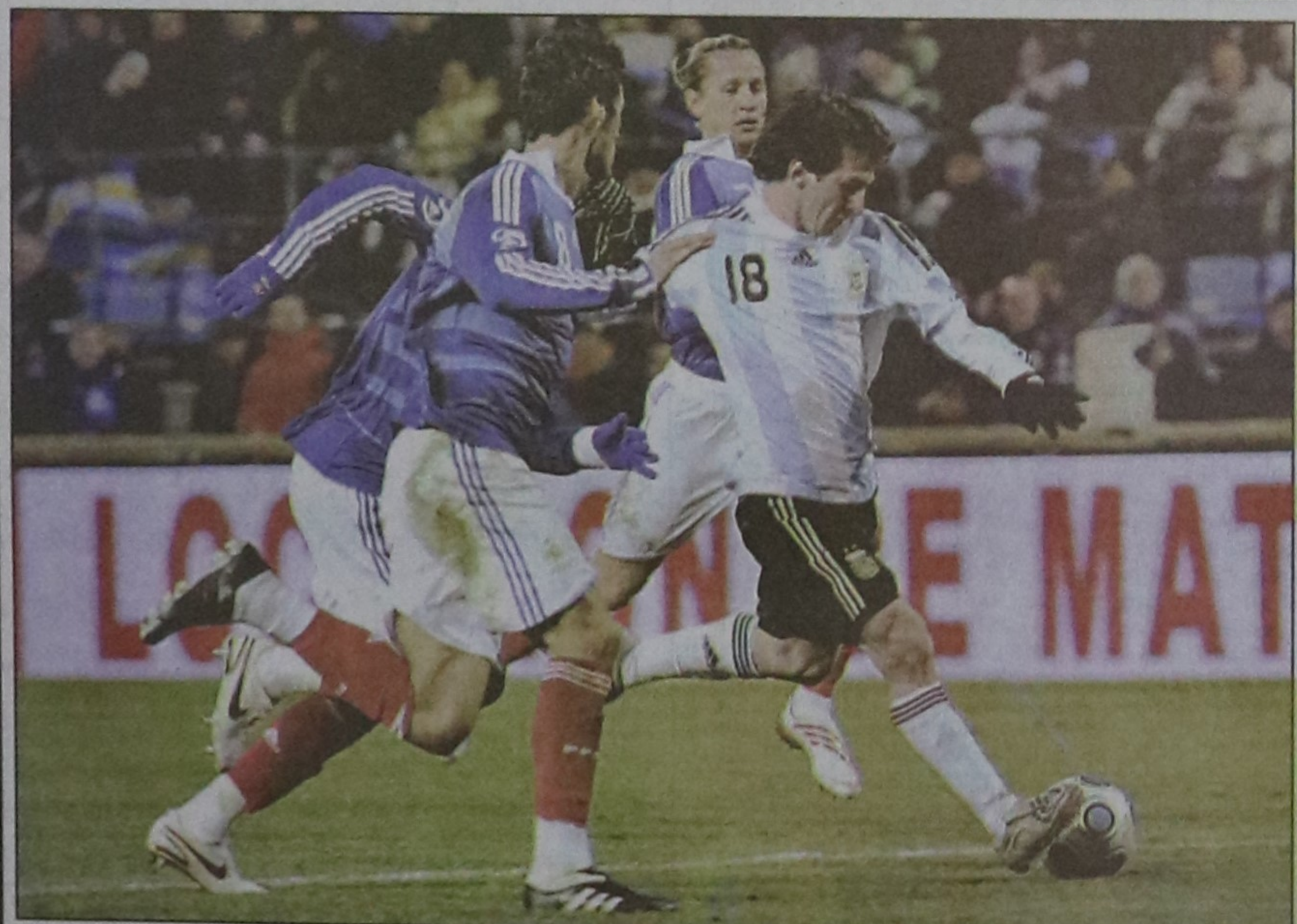
Argentina's hot property Lionel Messi (R) is about to fire in a grounder with his pet left foot for his side's second goal against France during a friendly football match at the Velodrome Stadium in Marseille on Wednesday.