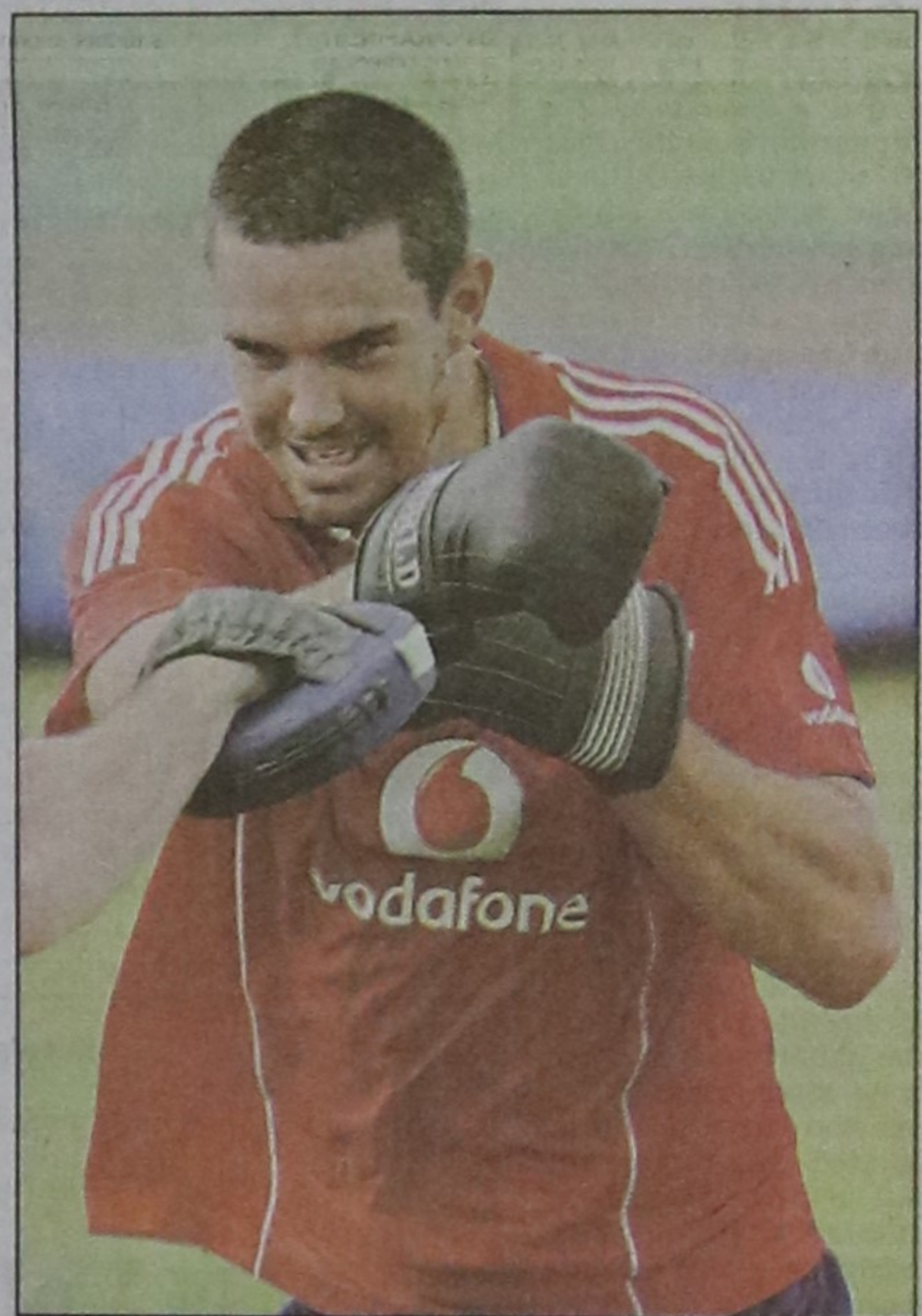
England cricketer Kevin Pietersen boxes during a practice session on Wednesday ahead of their second Test match against the West Indies starting in St John's today.