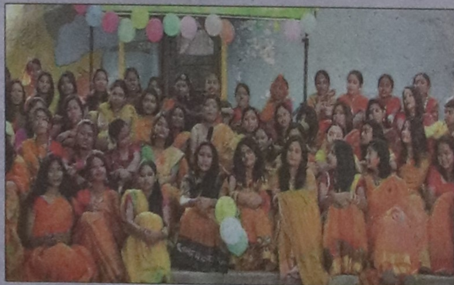
A scene from "Tiffiner Fa(n)key."

A special show on Falgun, in ntv's regular programme "Tiffiner Fa(n)key" will be aired at 5:35pm. A