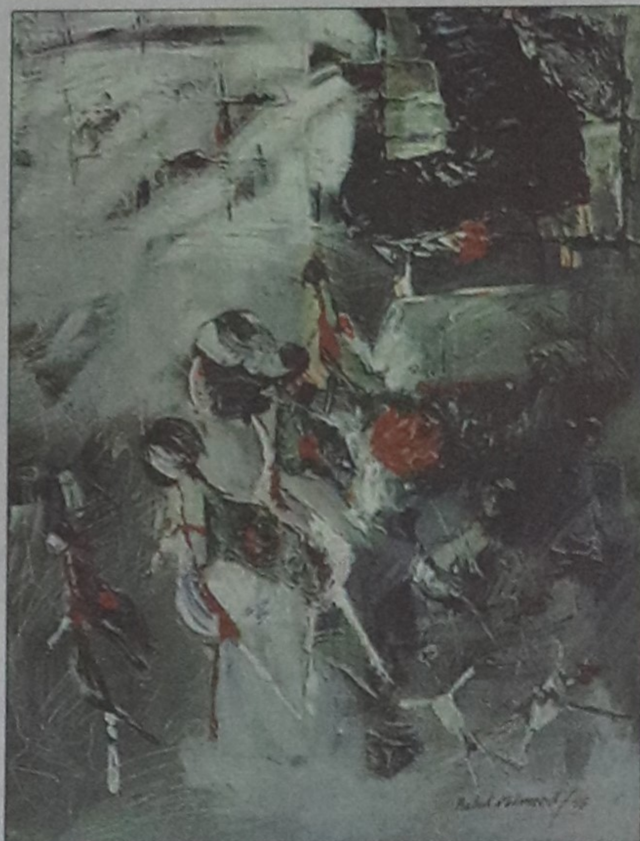
Artworks by Babul Mahmood.

Works in the "Birangana" series have been done in acrylic, one of the delicate mediums. "This subject is profoundly connected to the Liberation War. Like men, women of our country too played a vital role in the struggle for independence. Throughout the nine months of Liberation War, many