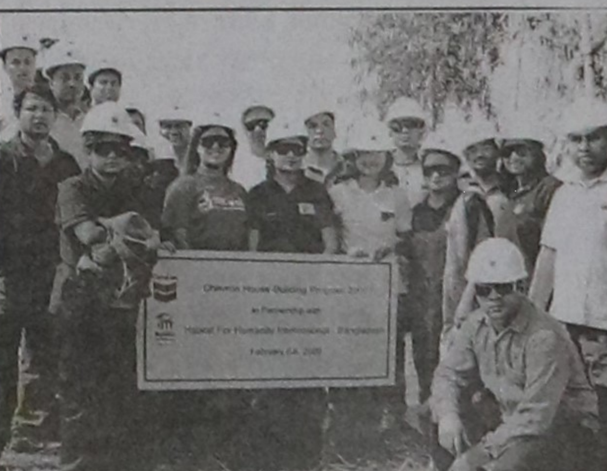
Staffs of Chevron Bangladesh, Dhaka office, and Habitat for Humanity took part in a two-day house-building programme at Madhupur in Tangail recently with a view to supporting the underprivileged to build low-cost but durable homes.