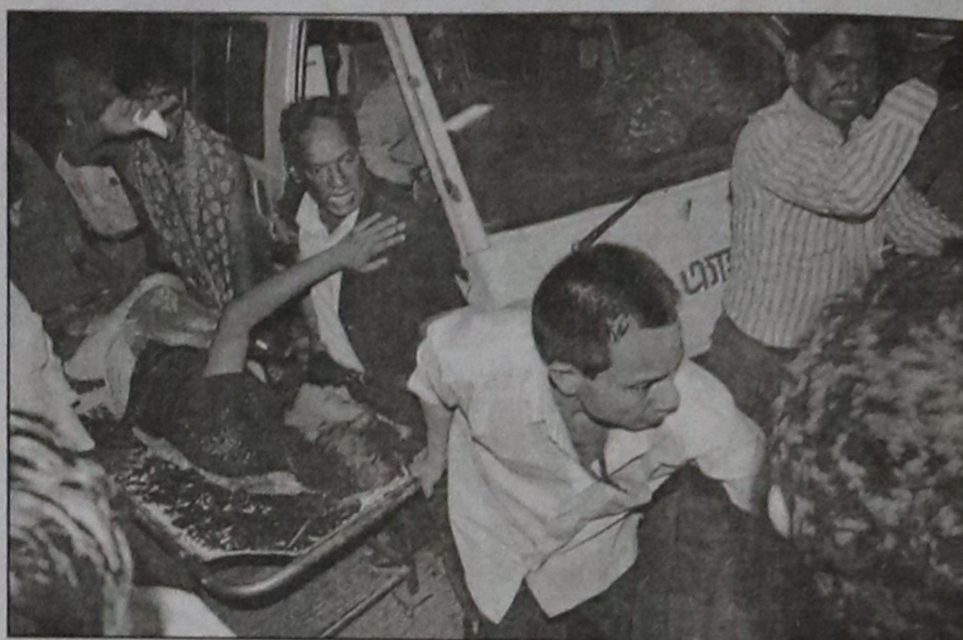
An injured student is being taken on a stretcher to the emergency unit at Chittagong Medical College Hospital yesterday after a picnic bus of Chittagong Govt College fell into a hilly ditch in Bandarban last evening. (Story on Page 1)

Earlier, an annual publication of BISS titled "Whither National Security Bangladesh 2007" was launched.