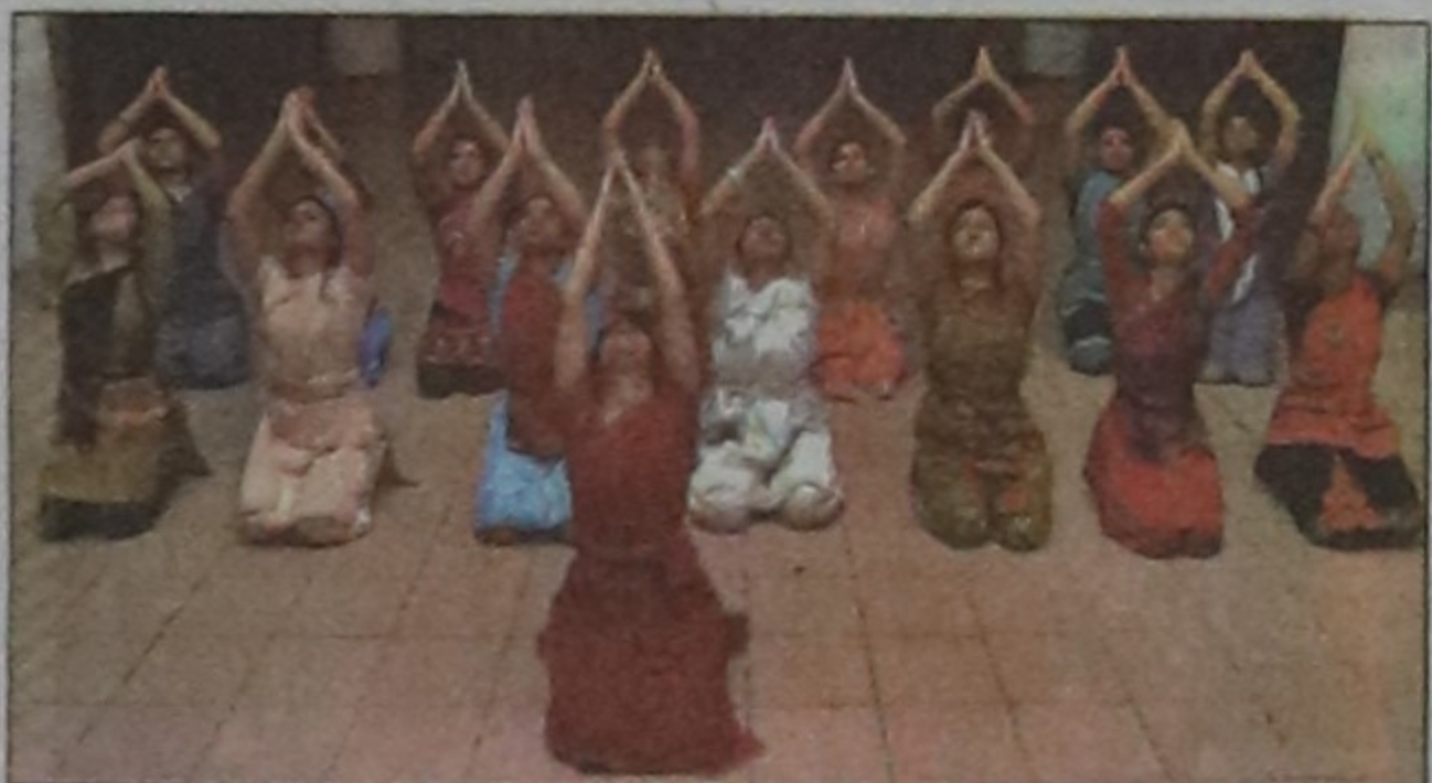
Students of Nrityanchal during a training session.

The event will feature most of the traditional Kathak elements, including "Saraswati Bandana," "Bhajan," "Thumri," "Taraana" and more. A special segment, titled "Protibimbo," mirror image of the artiste's movements, has also been included in the list. "Pathshala," another special segment, will feature all 250 students on the stage.