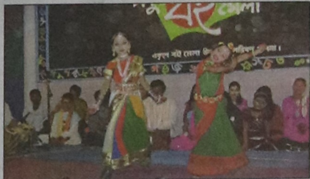
Young dancers perform at the programme.