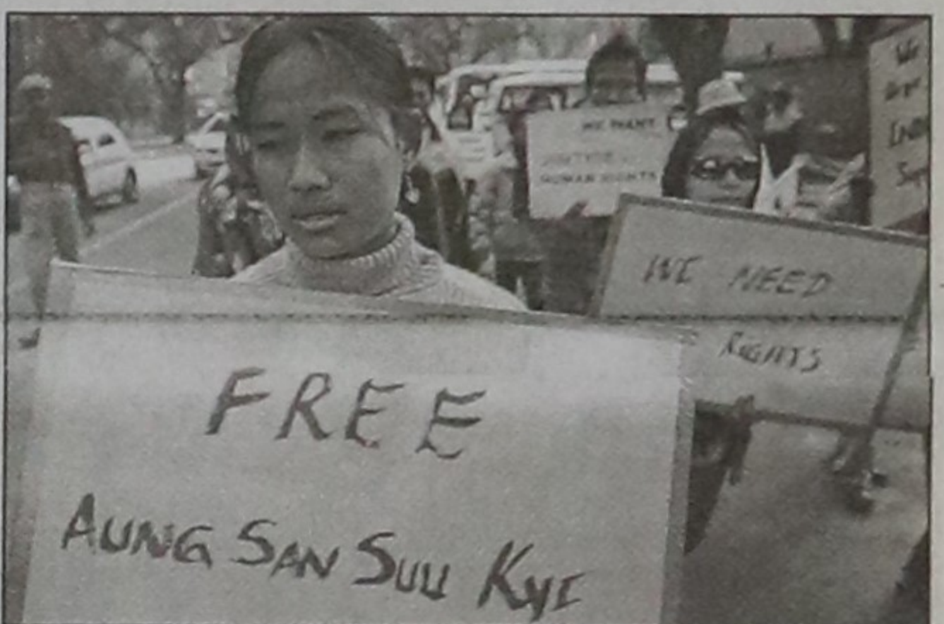
Myanmar pro-democracy activists hold placards and shout slogans during a protest in New Delhi yesterday. Burmese democracy supporters held a demonstration against alleged detention of freedom fighters in Indian jails for the past eleven years and also demanding the immediate release of Nobel Peace Prize laureate Aung San Suu Kyi.

He assured that he will try his best to open all girls schools in Swat because education is must for every male and female Muslim. He told ANP leaders that if Taliban will not surrender the arms after the imposition of Sharia regulation then he will also support Army operation against them.