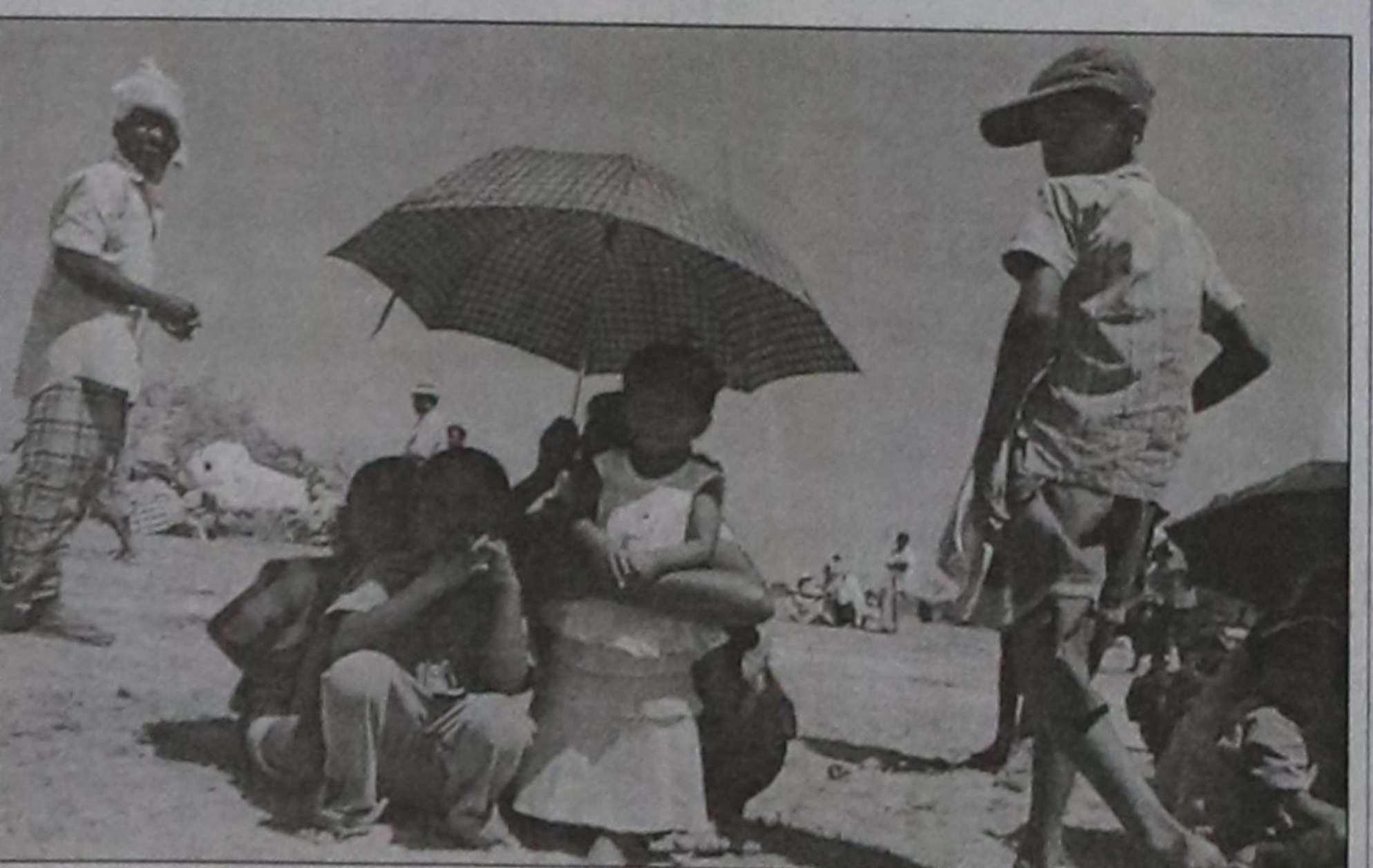
This picture released by Sri Lanka's ministry of Defence yesterday shows war displaced Tamil civilians taking shelter under an umbrella after escaping from Tamil rebel-held areas. International concern for the safety of civilians has mounted.

Islamist militants based in the tribal regions close to Afghanistan are fighting Pakistan's pro-American government. Peshawar, a bustling city with a history lawlessness, has seen regular attacks. The city lies on the main supply line for Western troops in Afghanistan.