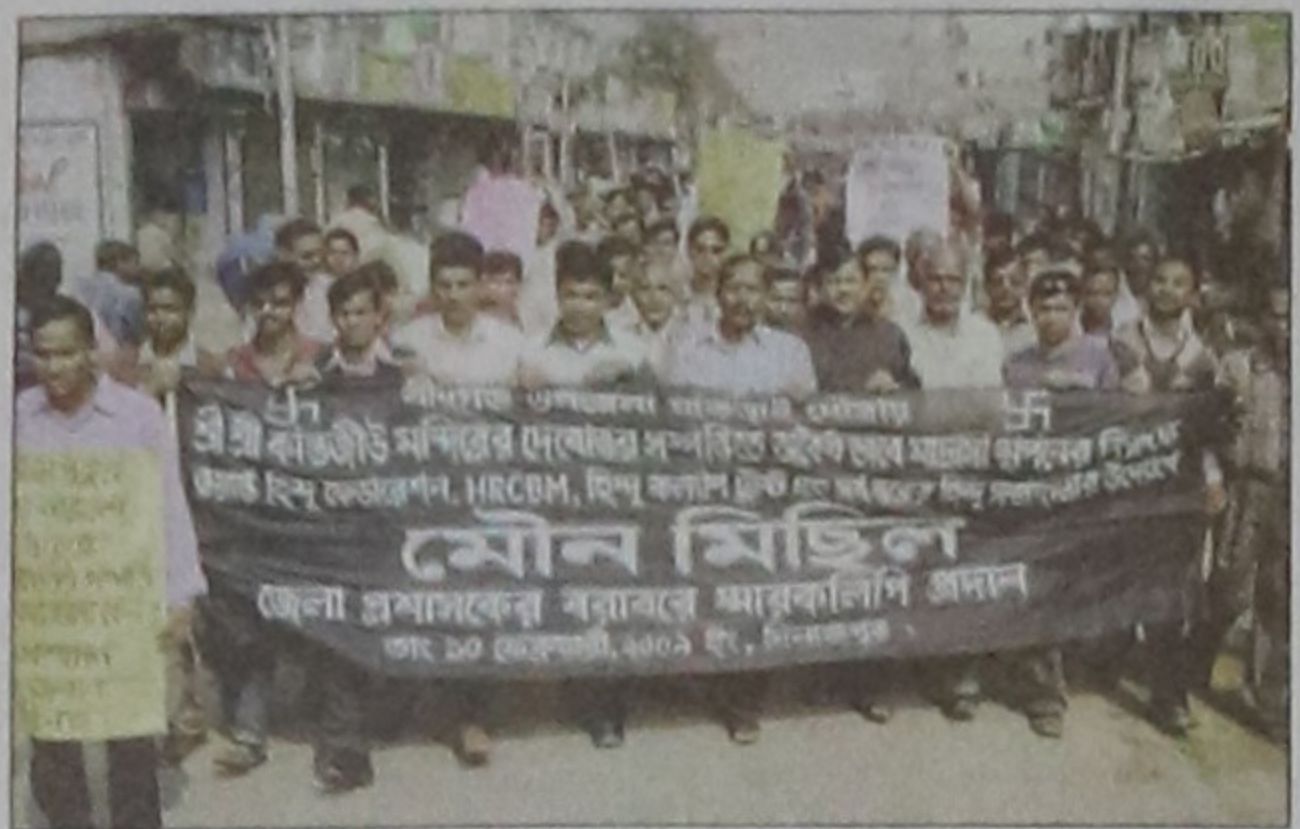
A silent procession demanding immediate steps to recover the grabbed land of Kantajieu Temple yesterday.