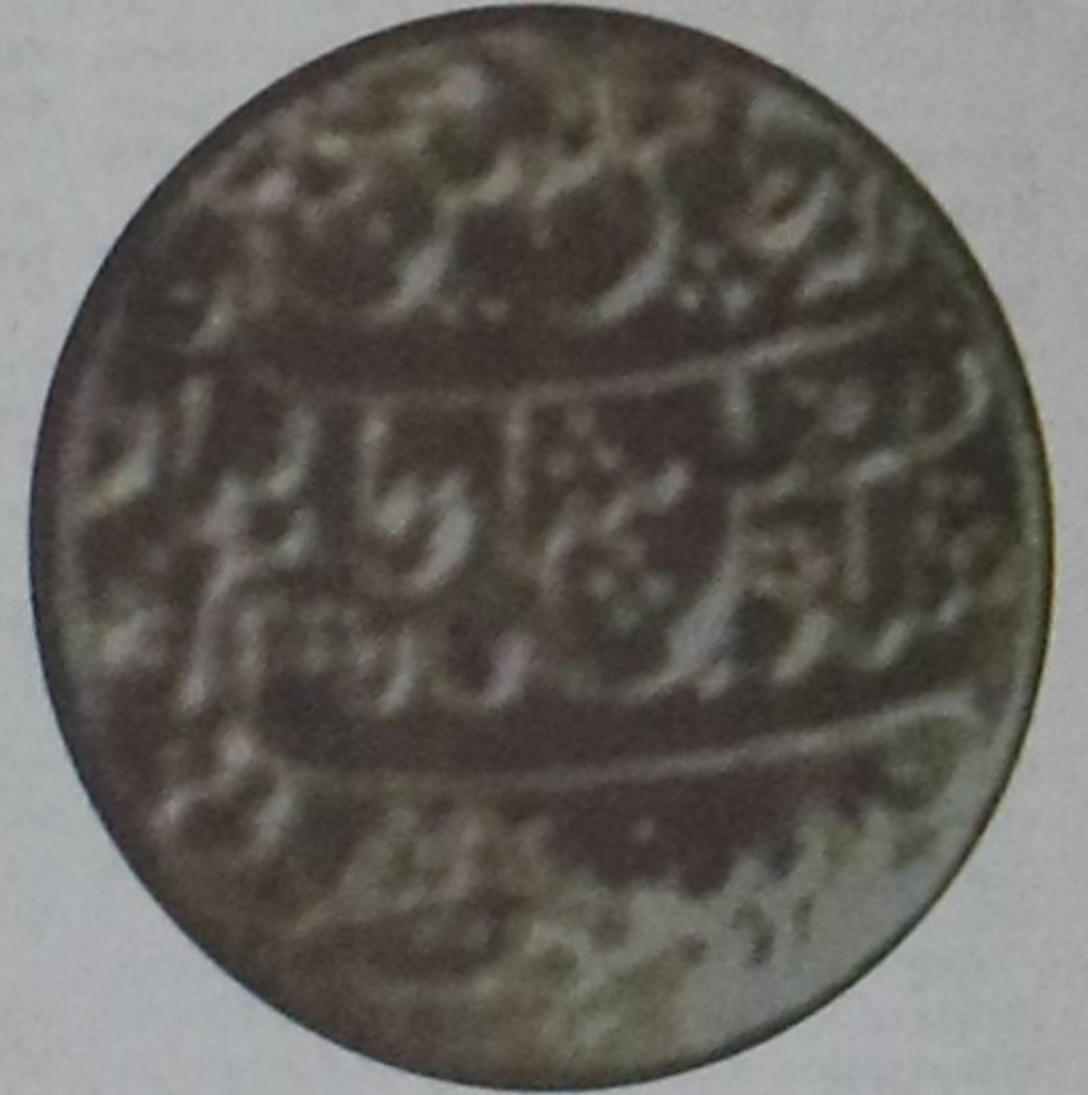
Arabic or Persian writing are engraved on the coins.