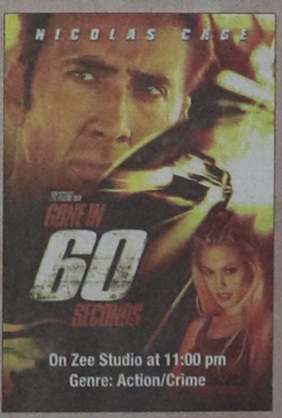
On Zee Studio at 11:00 pm Genre: Action/Crime