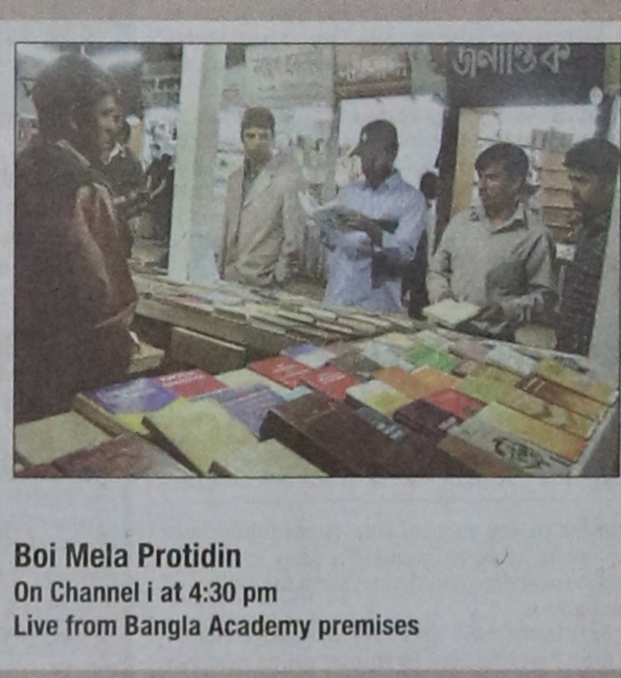
Boi Mela Protidin On Channel i at 4:30 pm Live from Bangla Academy premises