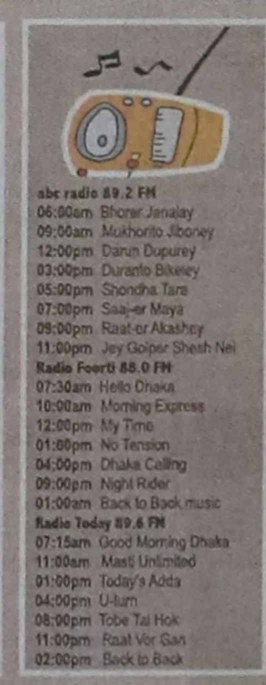
abc radio 89.2 FM 06:00am Shonar Jinalay 09:50am Mukhorib Jiborney