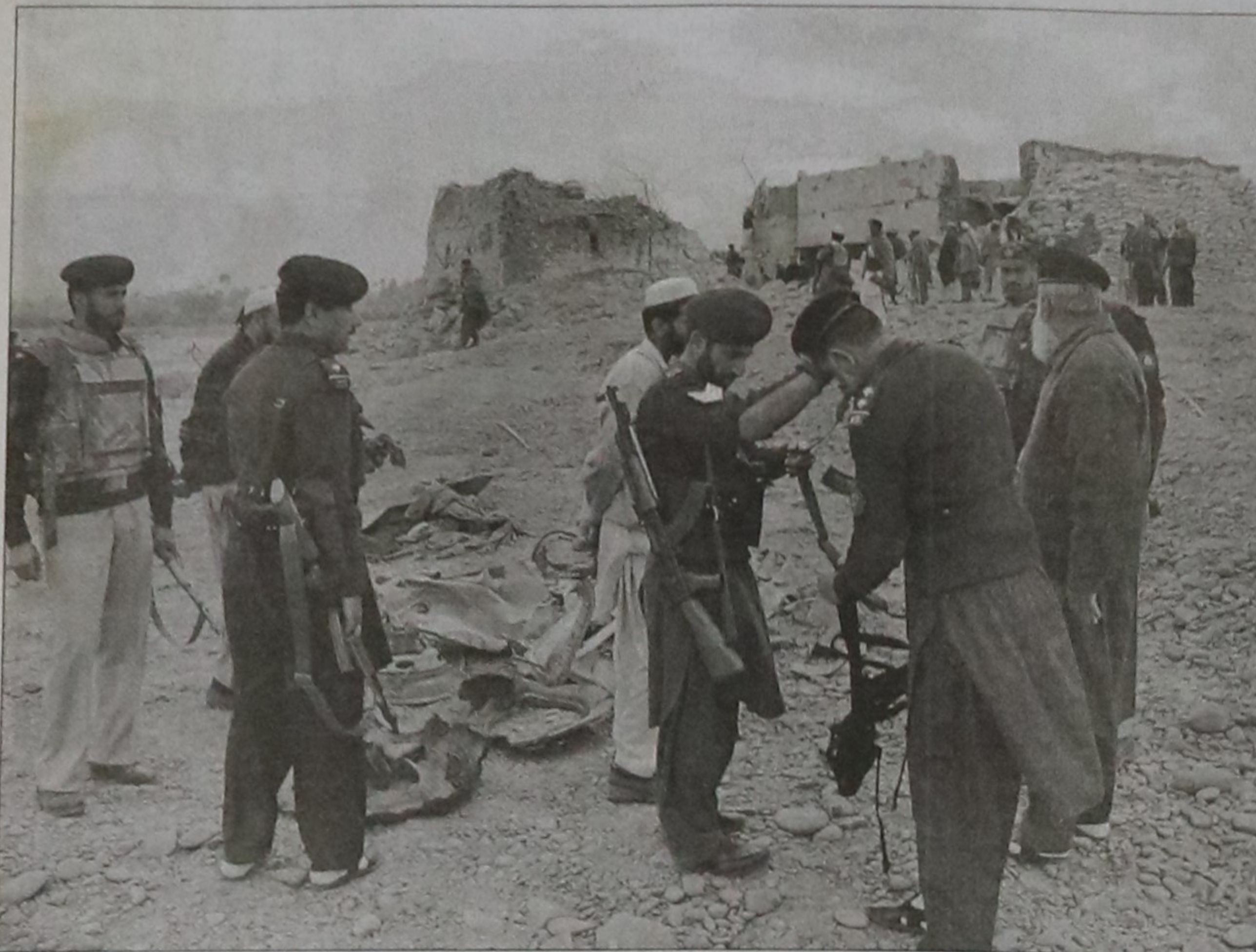
Pakistani security personnel gather at the site of a suicide attack at Baran Pul, about 50km east of Miranshah, the main town in North Waziristan province yesterday. A suicide bomber rammed an explosives-laden car into a police and frontier corps checkpoint in north-western Pakistan early Monday killing five of them.