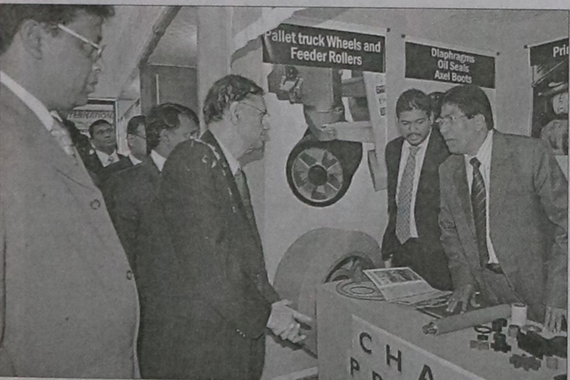
GL Pieris, Sri Lankan minister for export development and international trade, visits the Sri Lanka-Bangladesh friendship pavilion at the DITF 2009 recently.

A memorandum of understanding (MoU) regarding the 'Radiation Detection Equipment project' was signed between the Bangladesh and US governments in November, 2008.